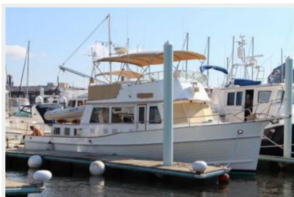
Starboard at Dock