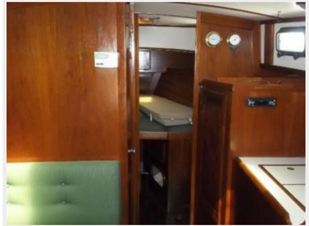
Main salon looking forward