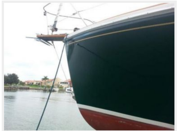
DARK GREEN HULL