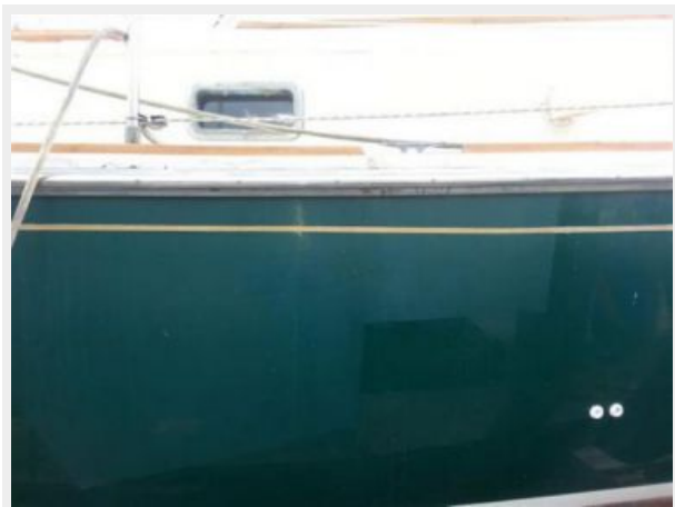
PORT HULL PILING BLEMISH