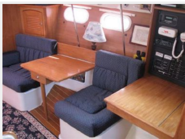
Sbd. Setee w/Convertible Table