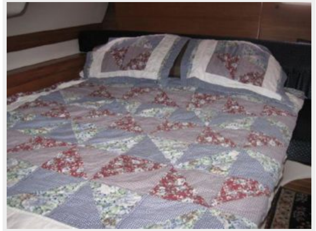
Aft Stateroom looking to Port