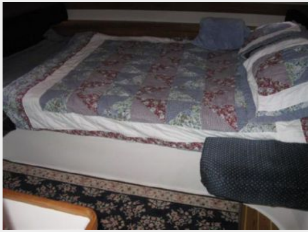
Aft Master Stateroom