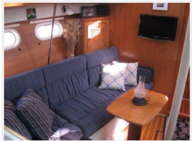
Port Settee and Dining Table