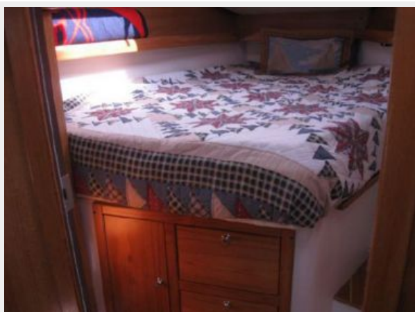
Forward Pullman Berth w/storage