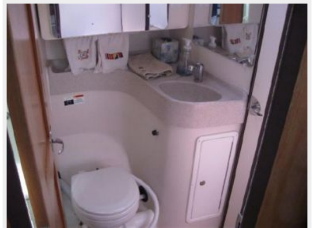
Head entry from Main Salon