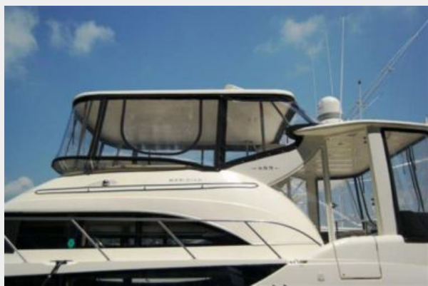
Hull Custom Hardtop