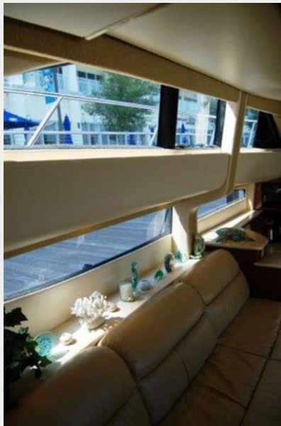
Salon Windows to Port