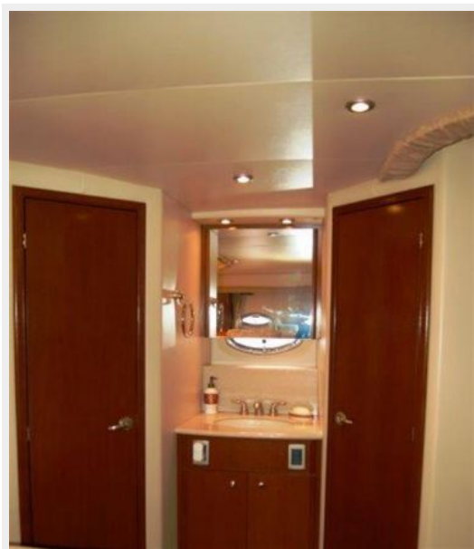
Master Stateroom- Entrance to Shower and Head