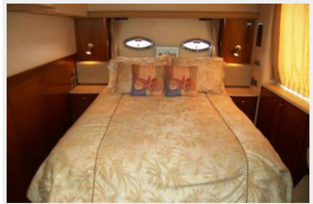
Master Stateroom Berth