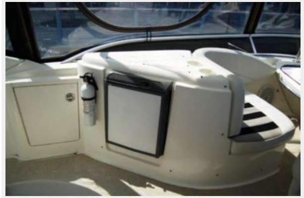
Flybridge Fridge and Port Seating