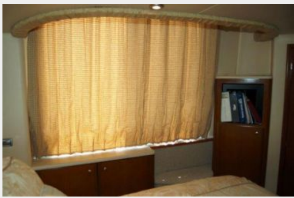
Master Stateroom- Sliding Doors to Cockpit