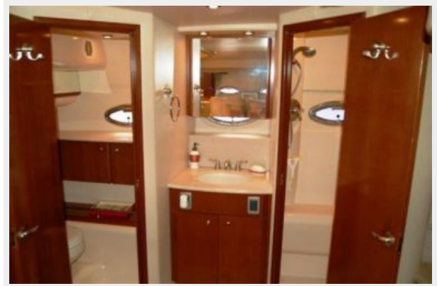
Master Head-Separate Head and Shower