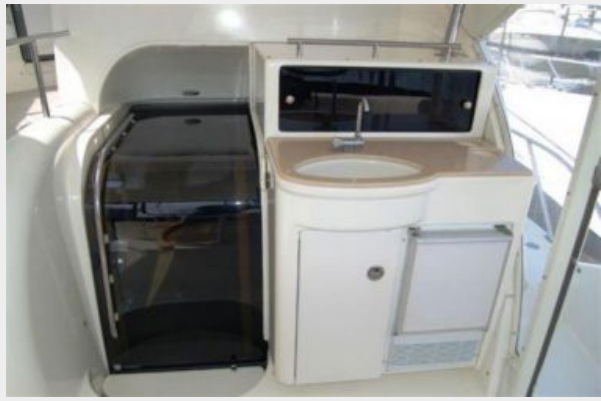
Flybridge-Entrance to Salon