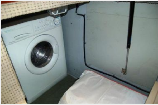
Galley- Washer Dryer Combo and Storage in Floor