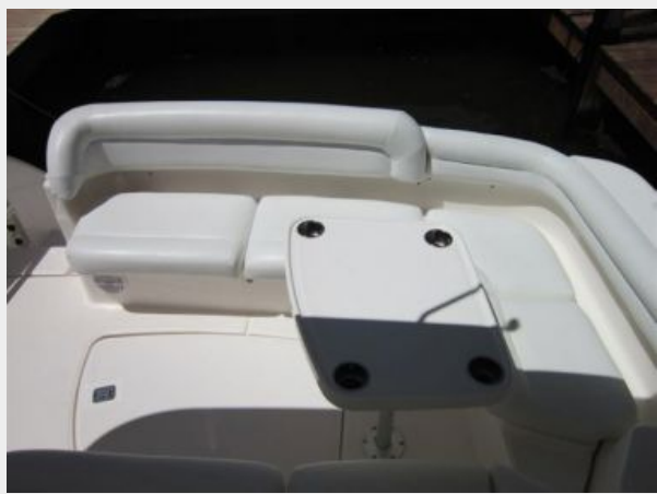
Lower Cockpit Seating