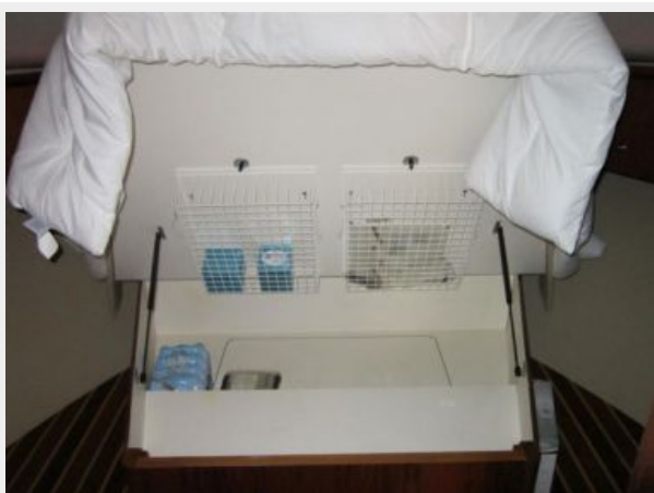
Master Berth Storage