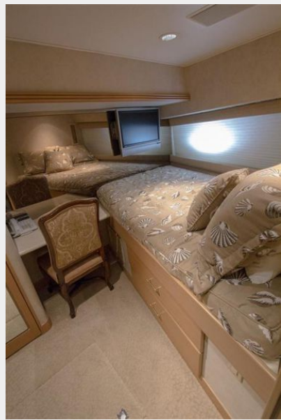
2nd Forward Guest Cabin with Desk