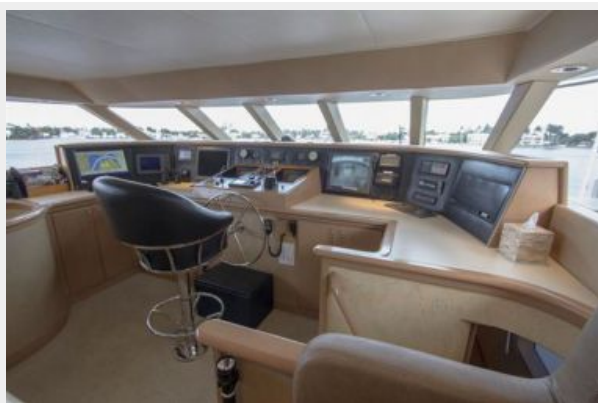
Main Helm Station