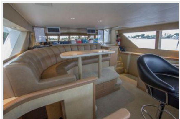
Observation Platform from Main Helm