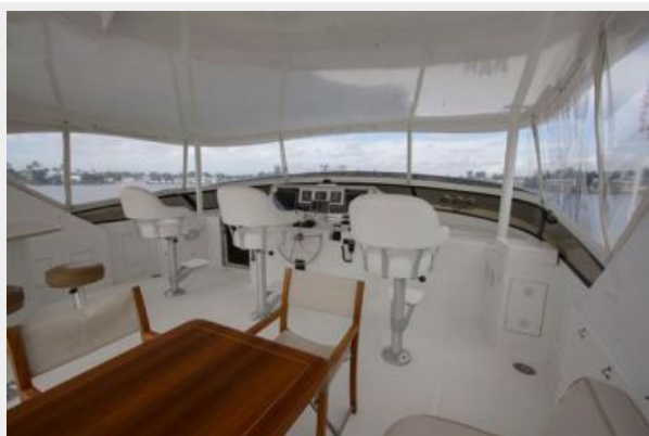
Flybridge Dinette and Helm