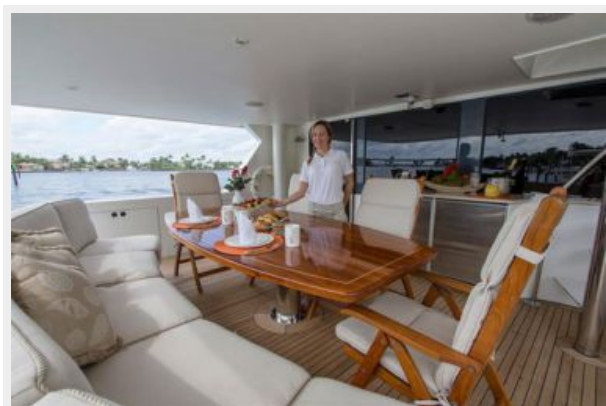
Aft Deck Al Fresco Dining