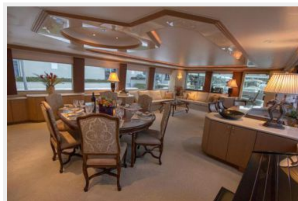
Formal Dining for Up to 10