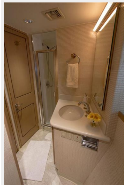
Forward Cabin Head and Shower