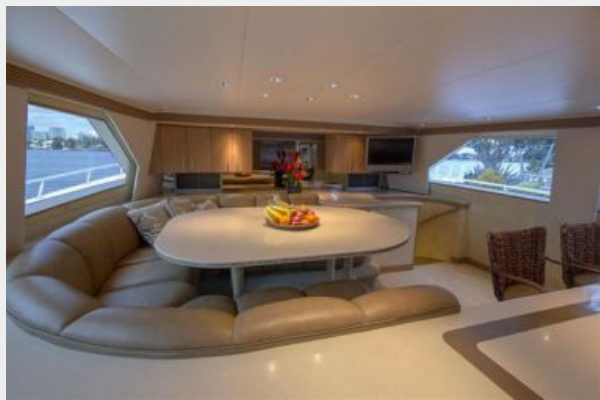
Country Kitchen Dinette