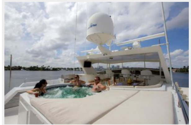
Flybridge Hot Tub and Entertainment Area