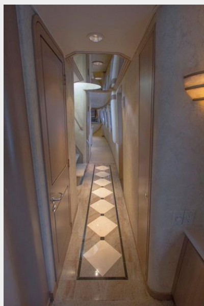
Starboard Access to Country Kitchen