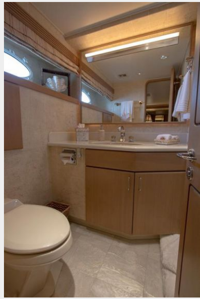
Mid-ship Twin Guest Stateroom Head