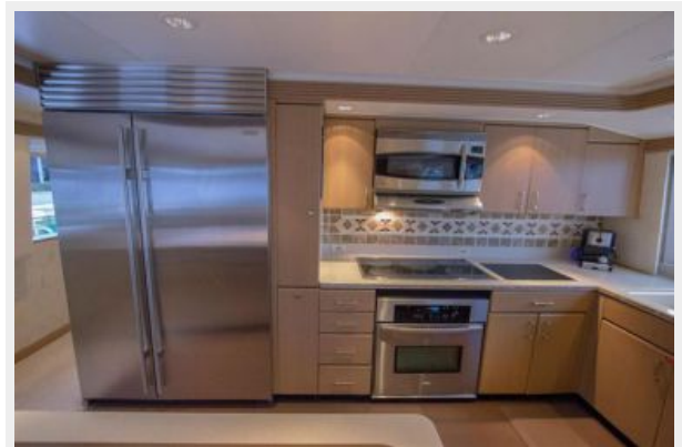
Updated Stainless Steel Galley Equipment