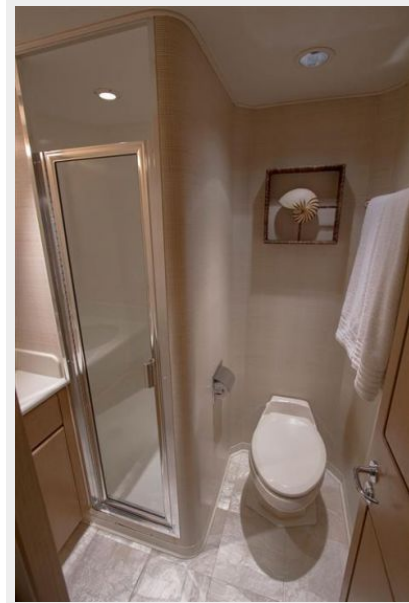
2nd Forward Guest Cabin Head and Shower