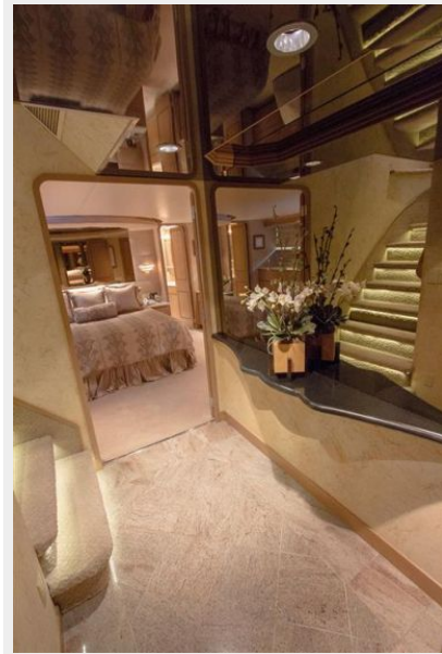
"Double Door" Entry to Master Stateroom