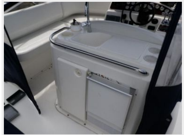
Fly Bridge Wet Bar