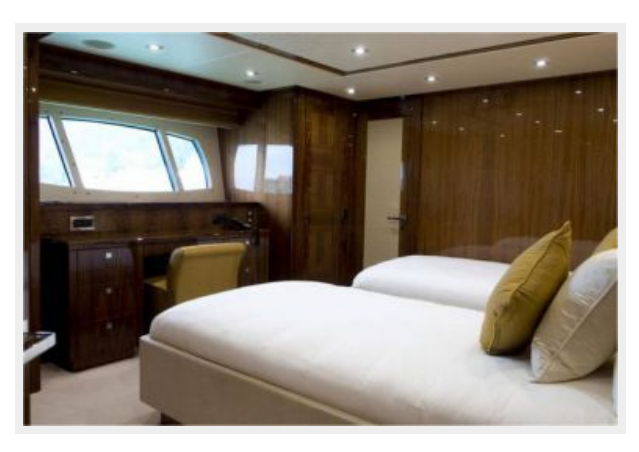
2013 Sunseeker 40 Metre Yacht 'Princess K' 2013 Sunseeker 40 Metre Yacht 'Princess K' - Guest Stateroom - Guest En Suite