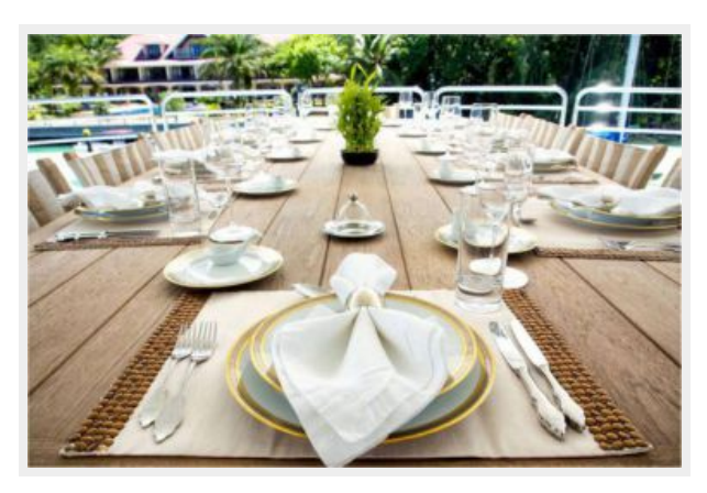
2013 Sunseeker 40 Metre Yacht 'Princess K' 2013 Sunseeker 40 Metre Yacht 'Princess K' - Upper Deck, Bar - Upper Deck, Saloon