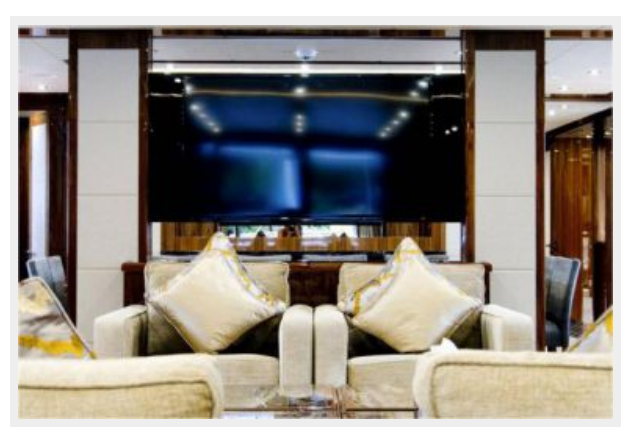
2013 Sunseeker 40 Metre Yacht 'Princess K' 2013 Sunseeker 40 Metre Yacht 'Princess K' - Master Suite - Master Suite