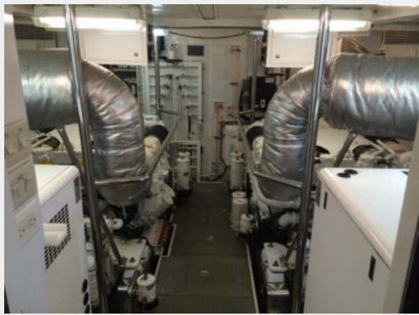
Engine Room Forward