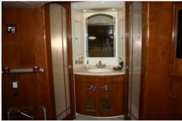
En Suite Master Bath