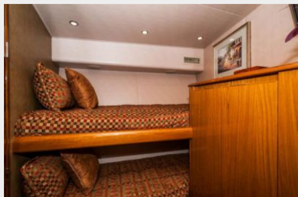
Port Forward Stateroom