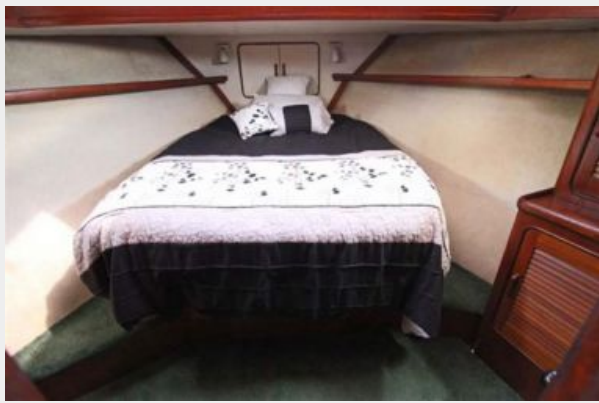
Forward Guest Stateroom W/Queen Sized Bed