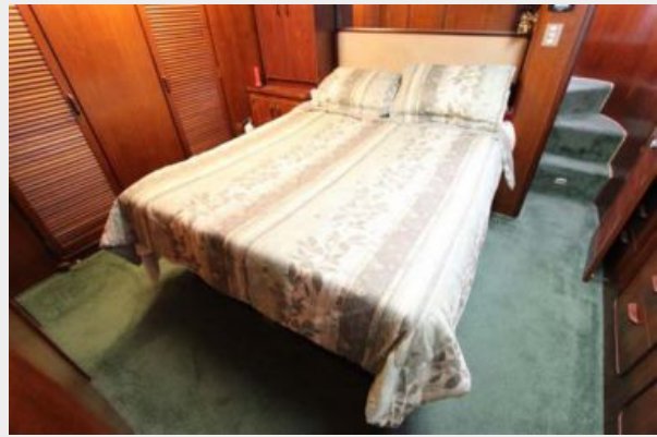
Master Queen Sized Bed