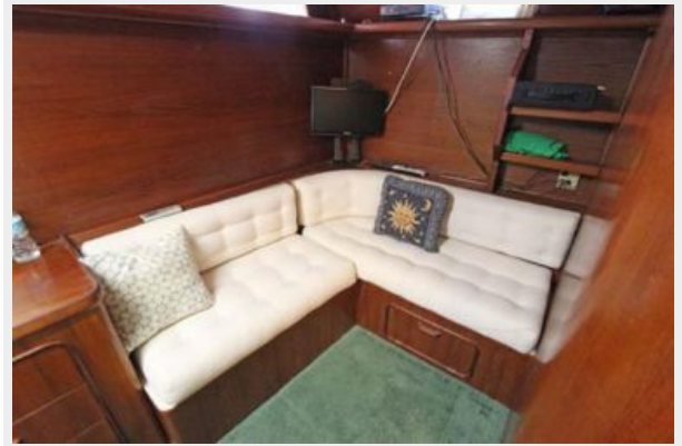
Master Stateroom Settee To Starboard