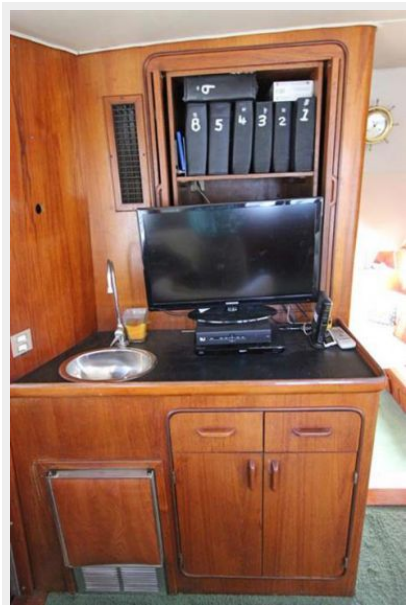
Aft Deck Wet Bar W/Sink, & Flatscreen TV