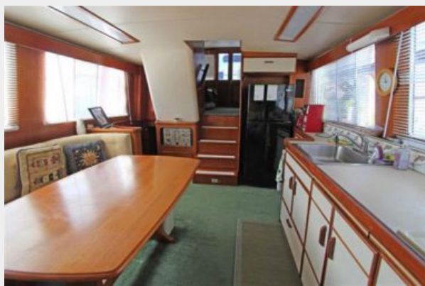
Lower Level Salon Looking Aft