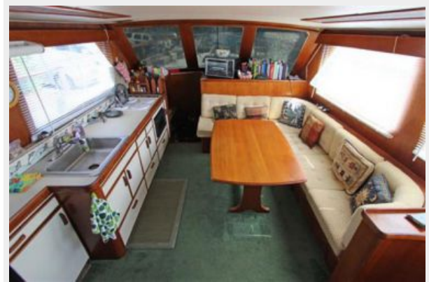
Lower Level Salon Looking Forward