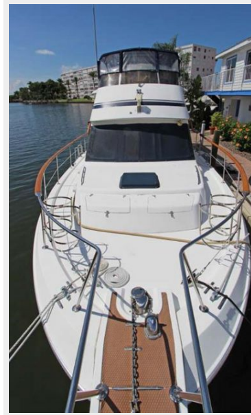
Bow View Looking Aft