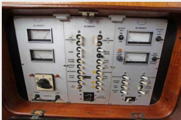
AC/DC Electrical Panel