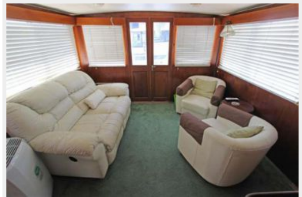
Aft Fully Enclosed Air Conditioned Deck W/Sofa & Barrel Chairs