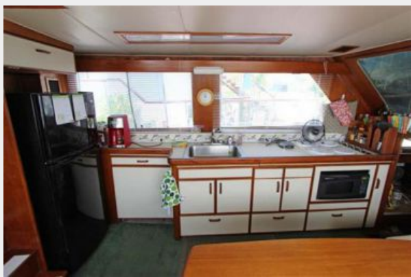
Galley To Starboard