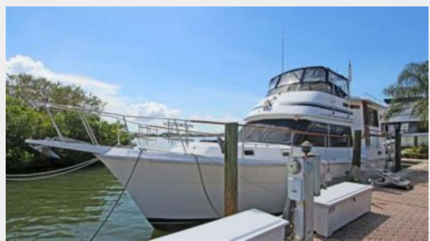
Port View Looking Aft