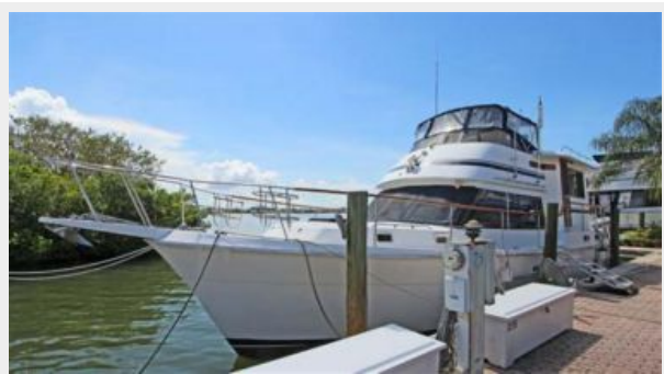
Port View Looking Aft