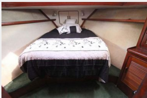
Forward Guest Stateroom W/Queen Sized Bed