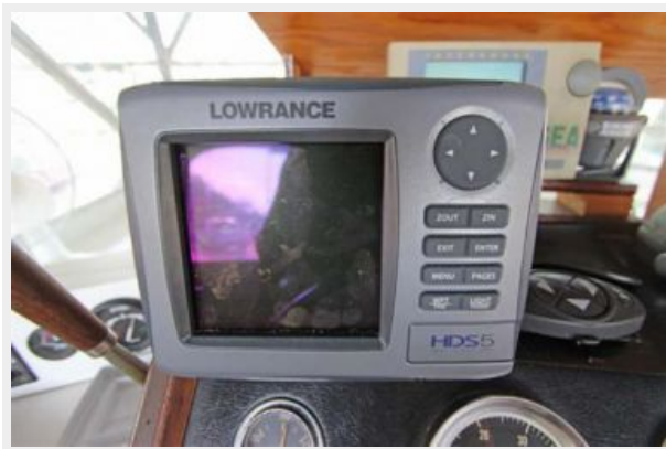
Lowrance Radar/Bottom Machine