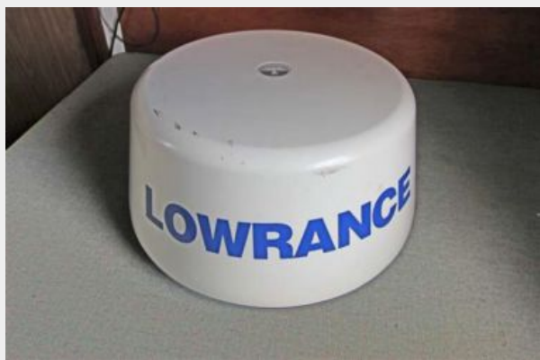
Lowrance Closed Array Radar (Easily Connects & Disconnects To Fit Into Owners Covered Slip)