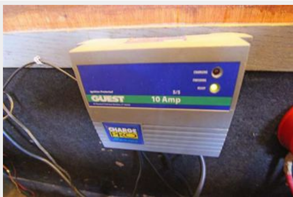
2-Guest 10 Amp Battery Chargers