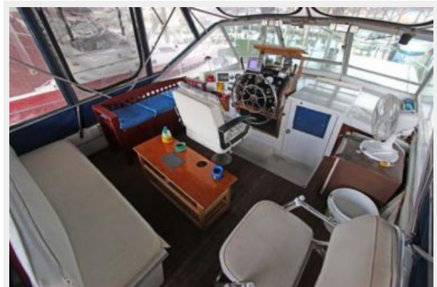
Spacious Flybridge W/Lots Of Seating