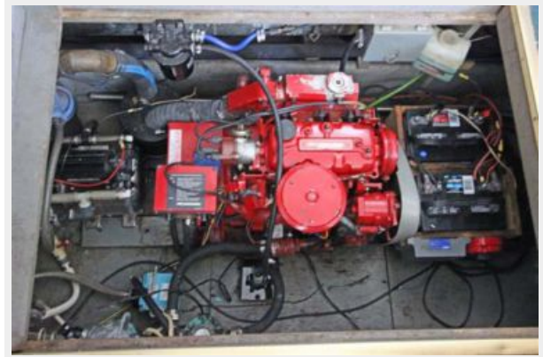
4.5 KW Westerbeke Generator (New 2003)