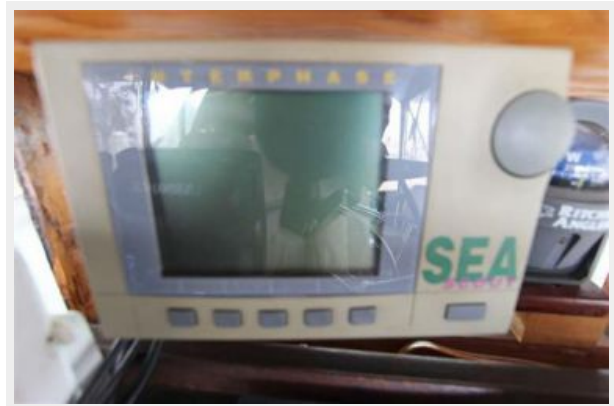
Interphase Sea Scout Forward Looking Sonar