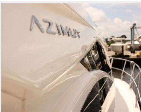
38 Azimut Fly