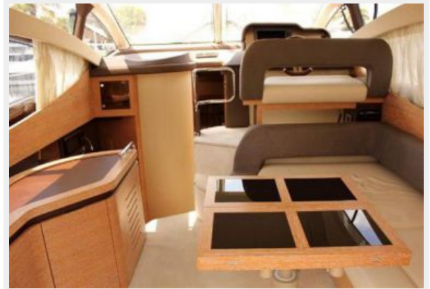
Salon Looking forward to Helm Station