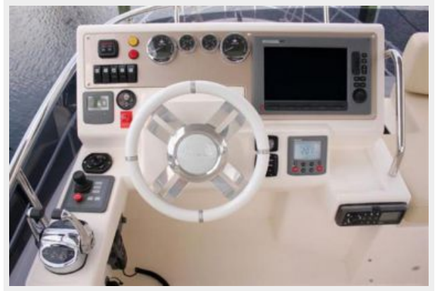
Flybridge Helm Station