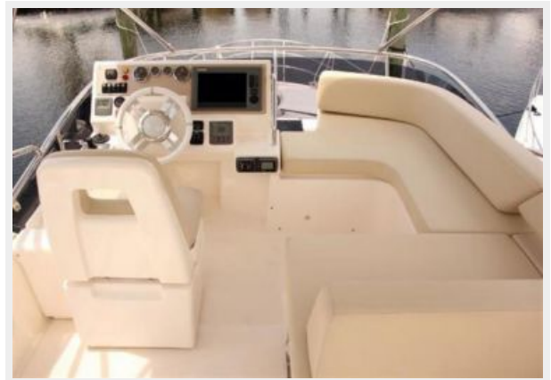
Forward Flybridge Seating