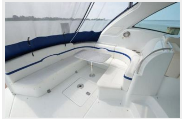
Cockpit Fridge, Icemaker & Grill