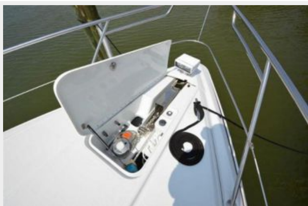
Recessed Windlass Compartment