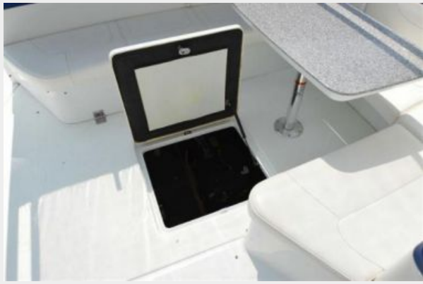
Hatch to Engine Room