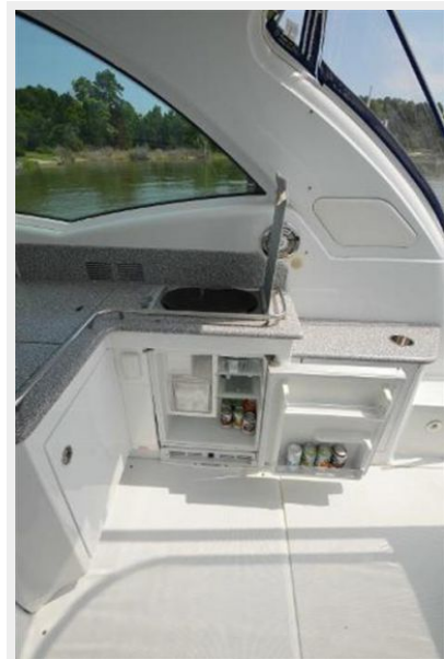
Cockpit Fridge, Icemaker & Grill