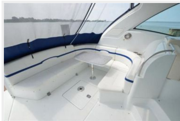
Cockpit Fridge, Icemaker & Grill