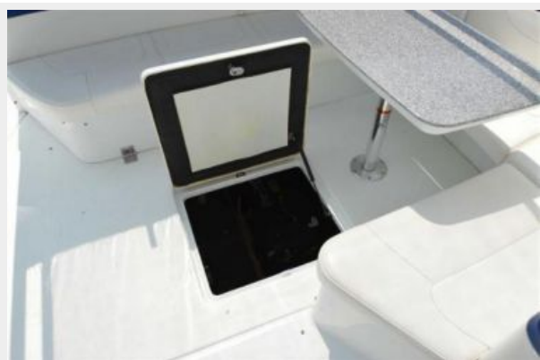
Hatch to Engine Room