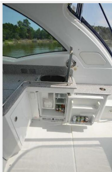
Cockpit Fridge, Icemaker & Grill