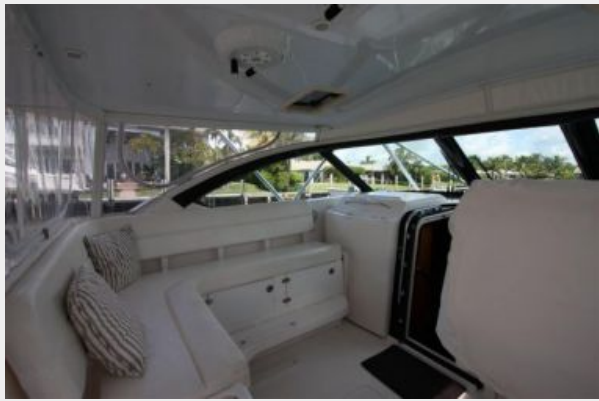
Bridge Port Forward