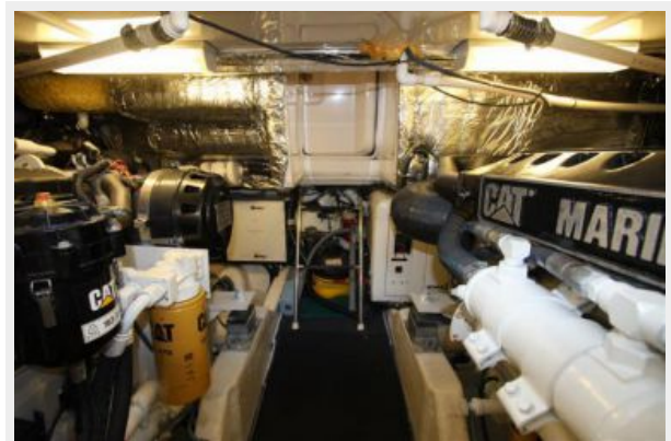
Engine Room Aft