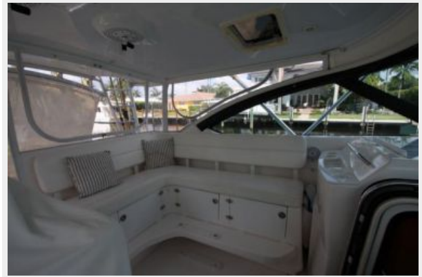
Bridge Seating Port Aft