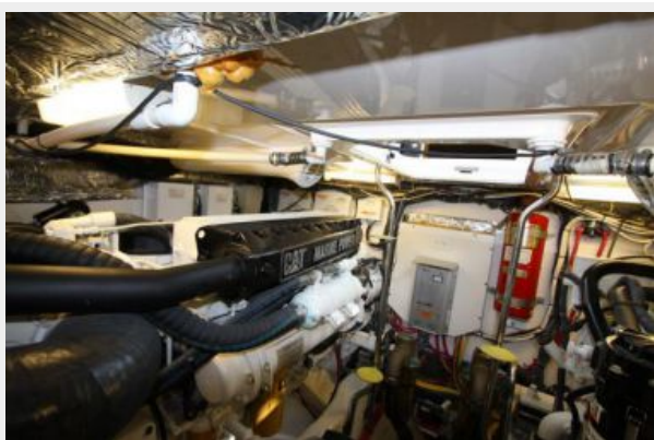
Engine Room Forward