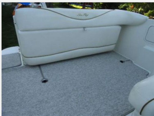
Aft Seating folded down