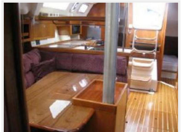
Main Salon facing aft