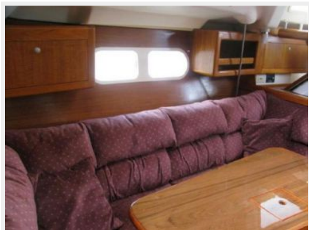
Main cabin settee and overhead bookshelf