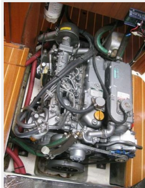
Yanmar diesel engine