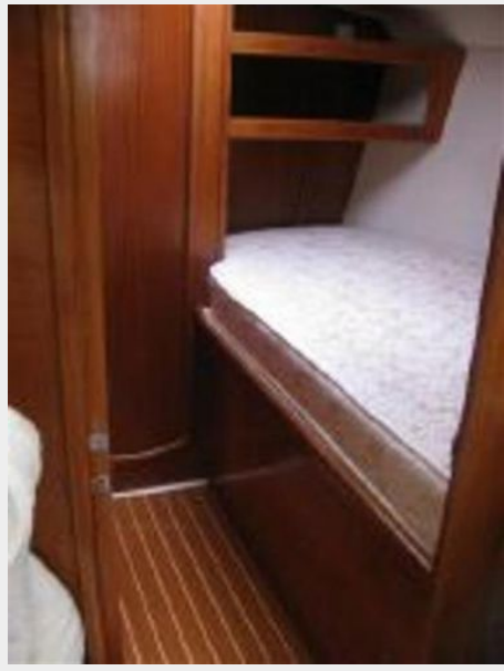
Forward Guest Cabin