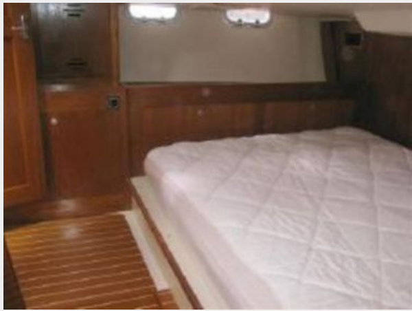
Master cabin queen berth and cabinets.