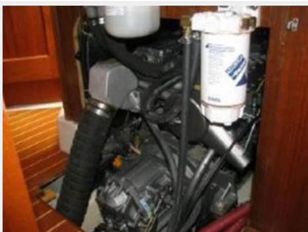
Back of engine access from master cabin