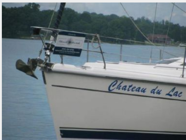
Stem with anchor rollers