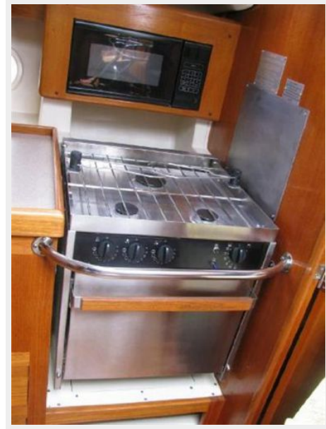
Stove and Microwave