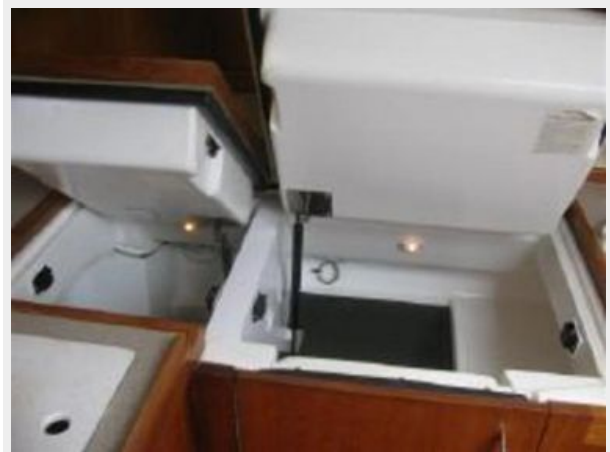
Top-loading refrigerator and freezer