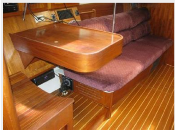
Nav Station and port side settee