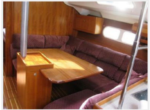
Main Cabin Starboard Side Settee and Table