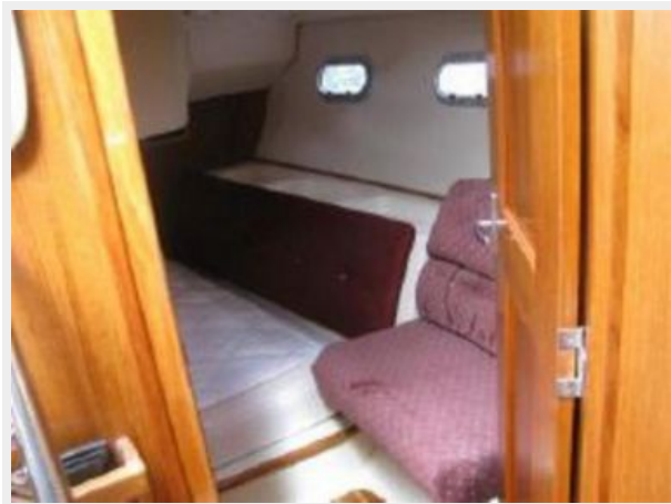
Aft Master Cabin with Settee