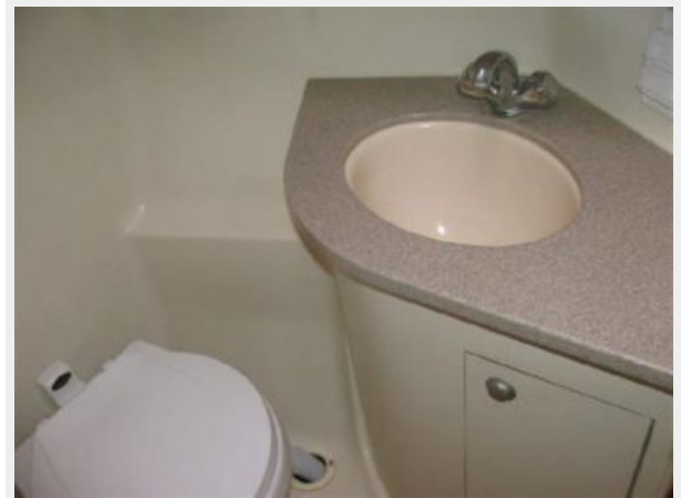
Forward Guest Head