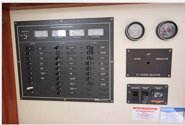
AC/DC Electrical Panel