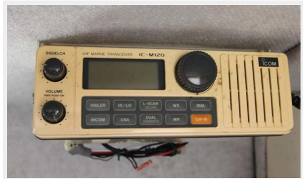
ICOM IC-M120 Marine VHF Radio Mounted In Salon