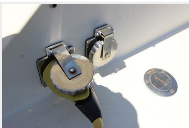
30 Amp Shore-Power Service