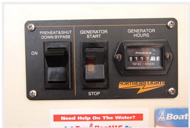
Northern Lights Generator Control & Hour Meter 117 Hours