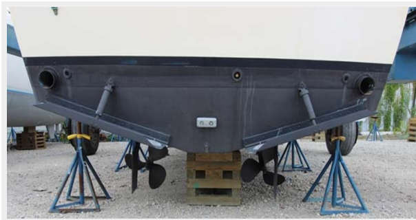
New Bottom Paint & Cutlass Bearings July 2014