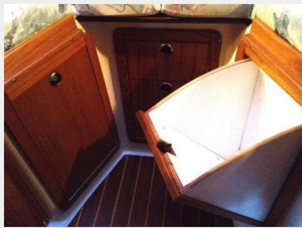
Vee Berth Hamper