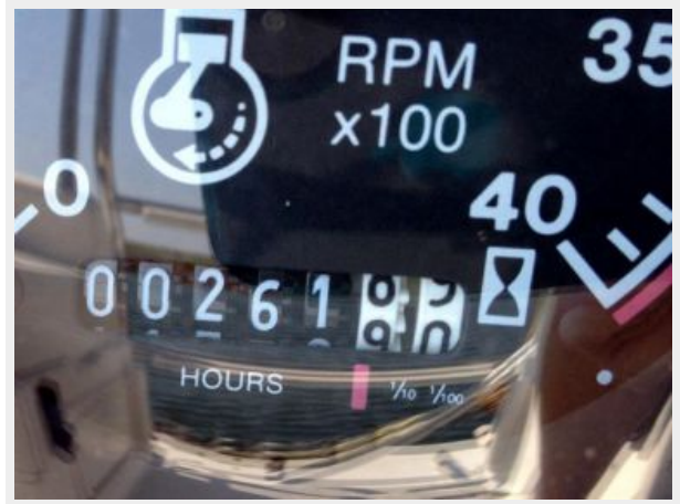
Original Engine Hours