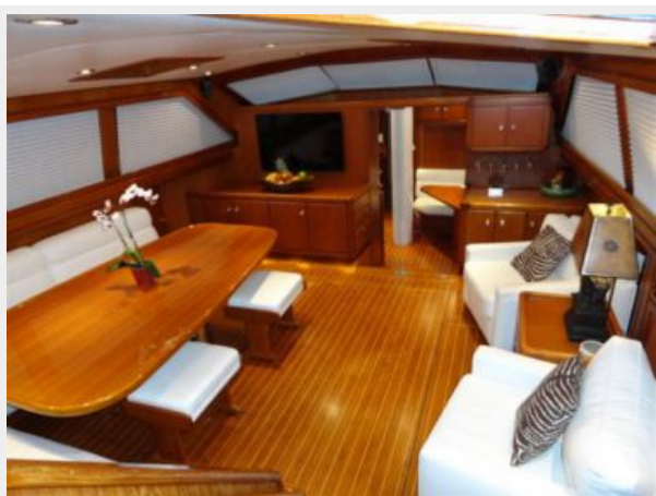
Main Saloon Looking Forward