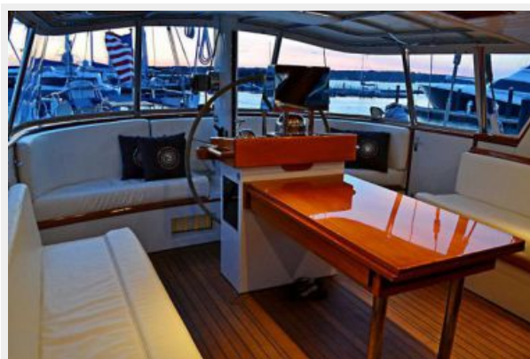
Pilothouse Looking Aft