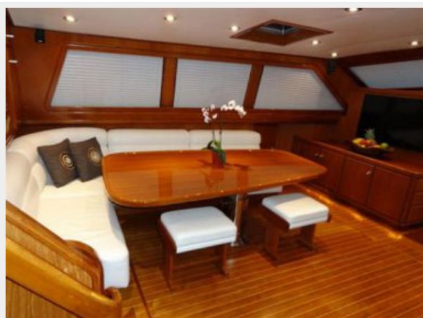
Main Saloon Port Side