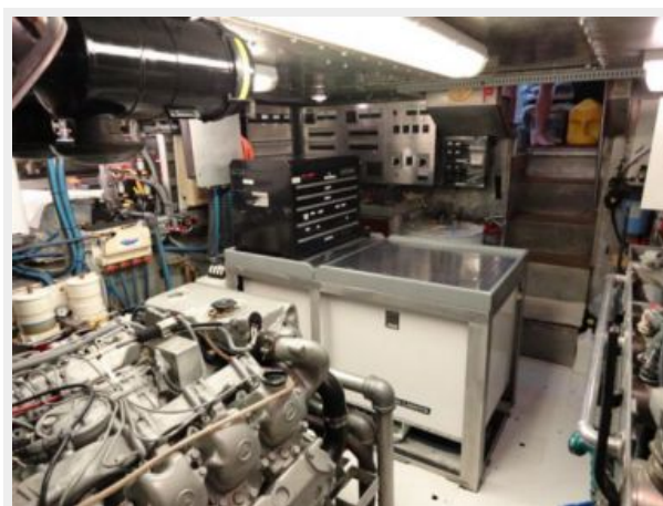
Engine Room Looking Forward