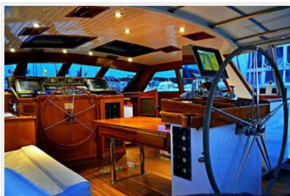
Pilothouse Looking Forward