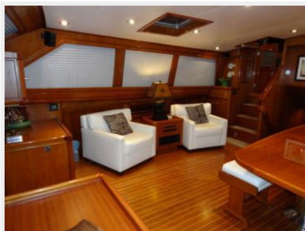
Main Saloon Starboard Side