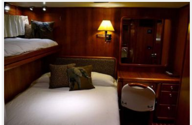
Port Guest Cabin