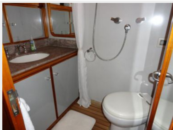
Port Guest Head