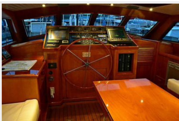
Forward Helm Station