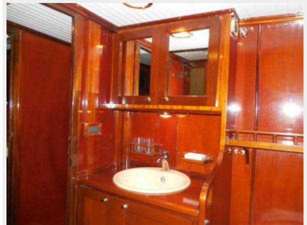
Guest Cabin Vanity