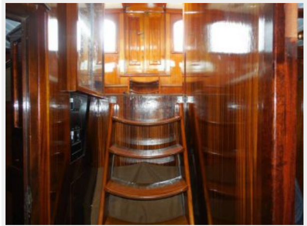
Steps To Deckhouse