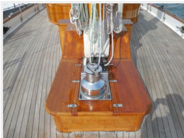
Foremast Halyard Winch