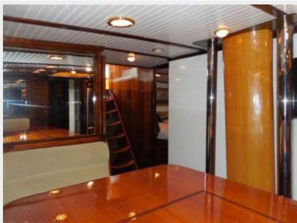
Aft From Dining Table