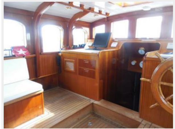
Deckhouse To Port