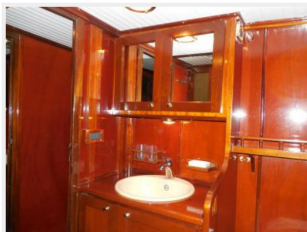
Guest Cabin Vanity