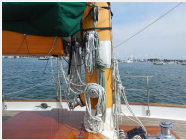
Carbon Fibre Foremast