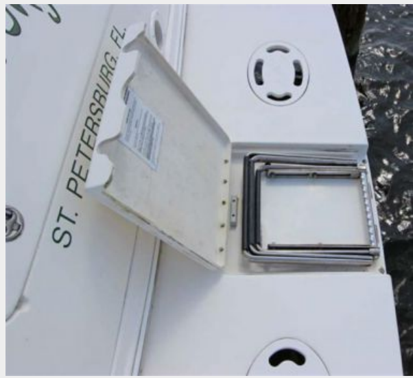
Stainless Fold-Down Ladder