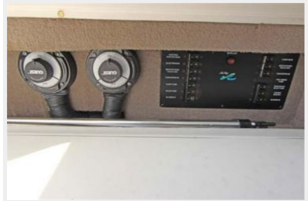
Guest Battery Switches & Breaker Panel