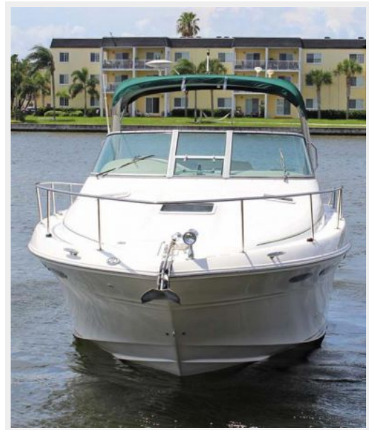
Bow View In Water