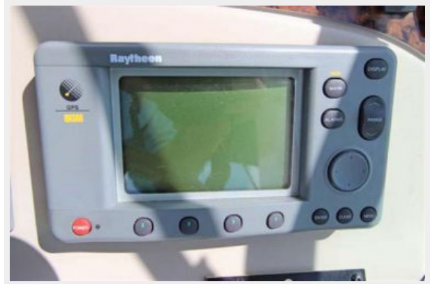
Raytheon RN300 GPS