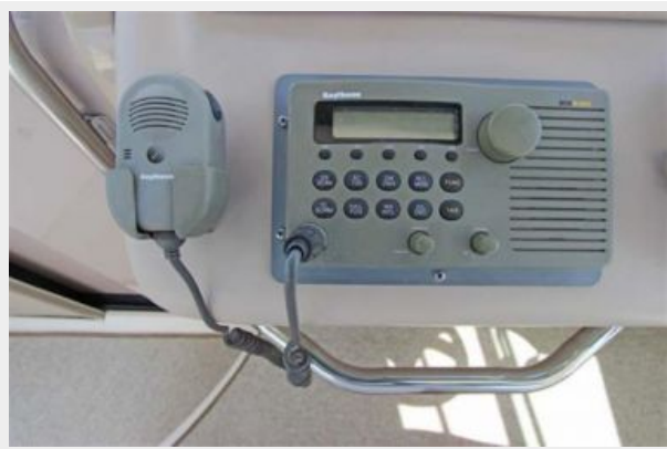
Raytheon 220 Marine VHF