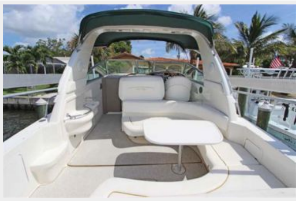
Cockpit Looking Forward