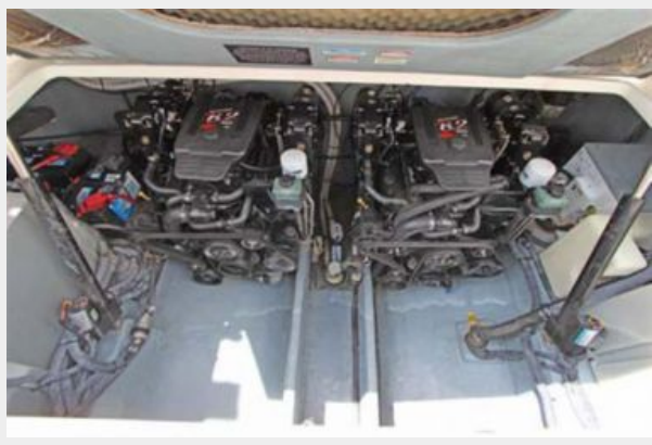
Spotless Engine Room W/Electric Hatch