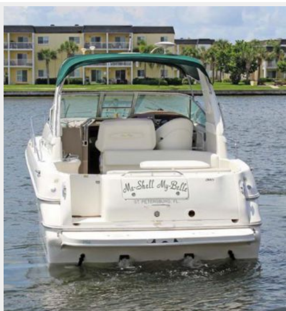
Stern View In Water