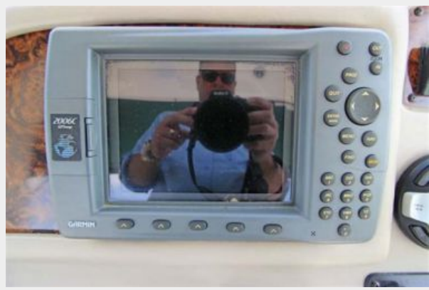
Garmin 2006C Plotter/Sounder