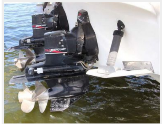
Bravo III Sterndrives & Trim Tabs