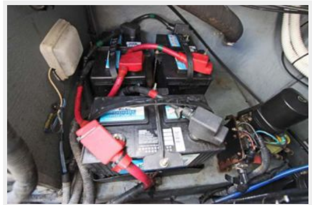
3-Group 24 Marine Batteries