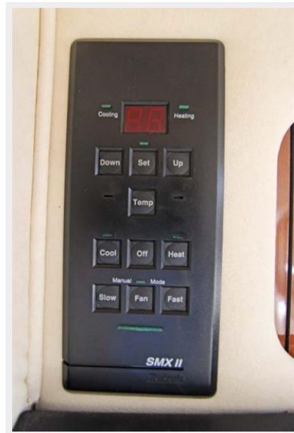
Reverse Cycle AC/Heat