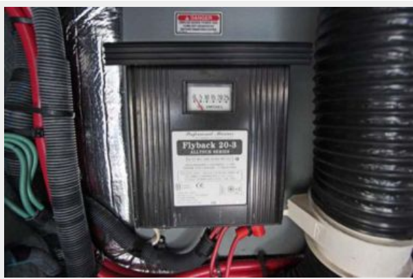
20 Amp Marine Battery Charger