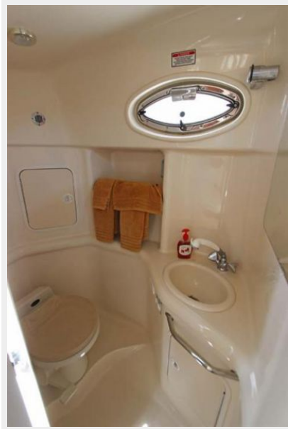
Head W/Vacuflush Marine Toilet, Sink, & Shower