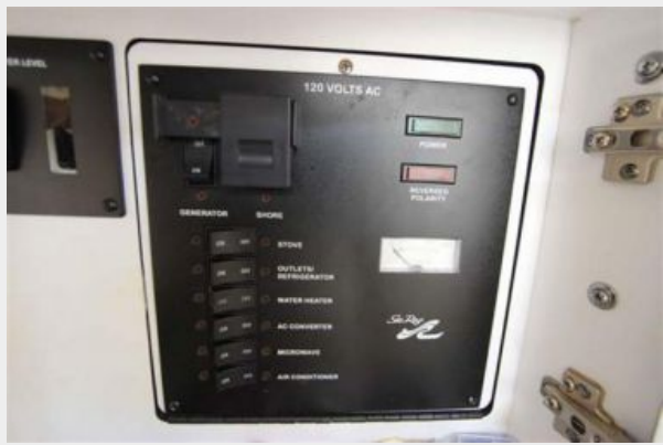
AC Electrical Panel