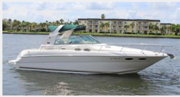
Starboard View In Water