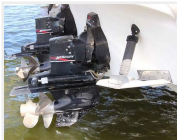
Bravo III Sterndrives & Trim Tabs