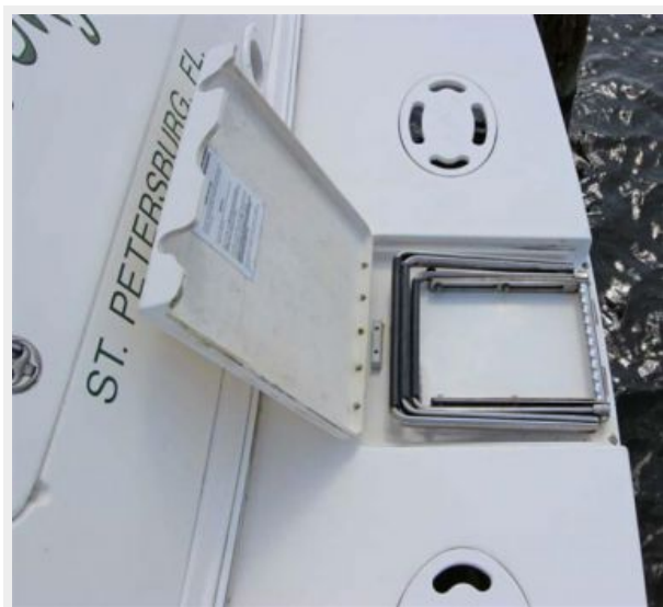
Stainless Fold-Down Ladder