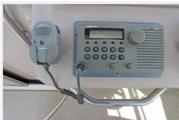
Raytheon 220 Marine VHF