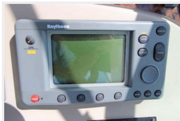
Raytheon RN300 GPS