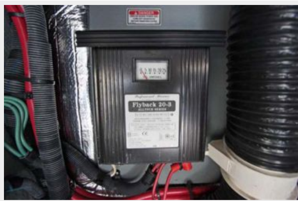
20 Amp Marine Battery Charger