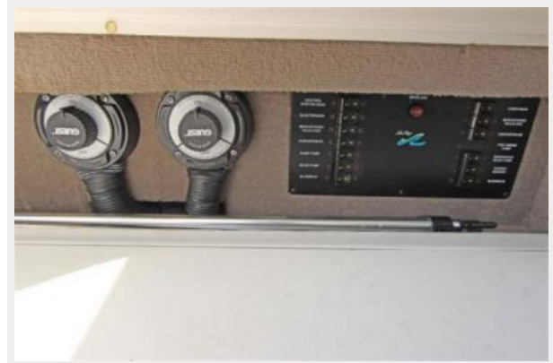
Guest Battery Switches & Breaker Panel