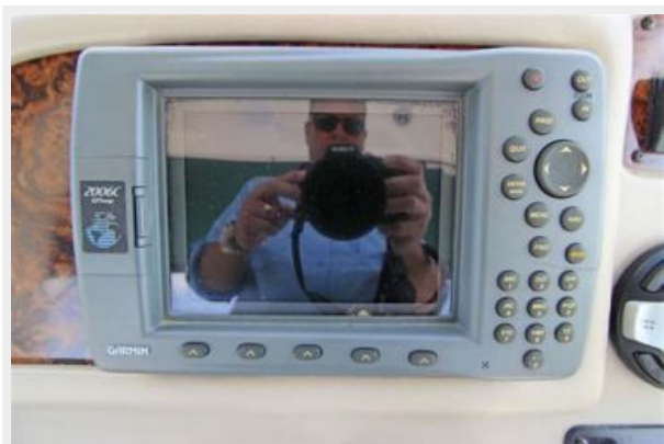
Garmin 2006C Plotter/Sounder