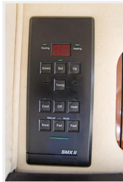
Reverse Cycle AC/Heat