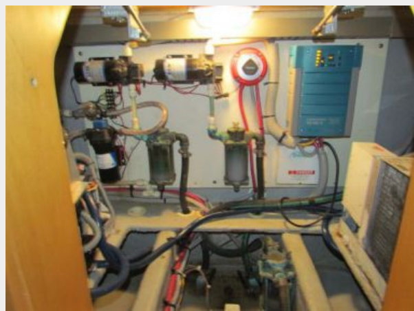
Equipment under stairs