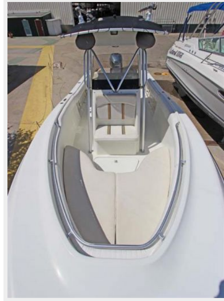
Bow Looking Back