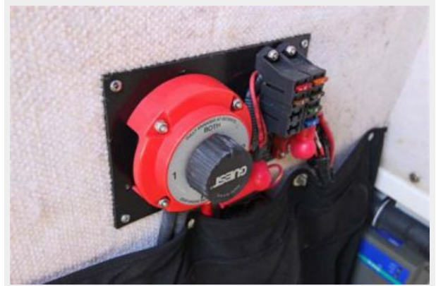
Guest Battery Switch