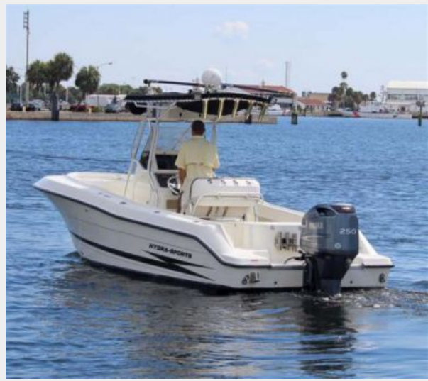
Stern View In Water