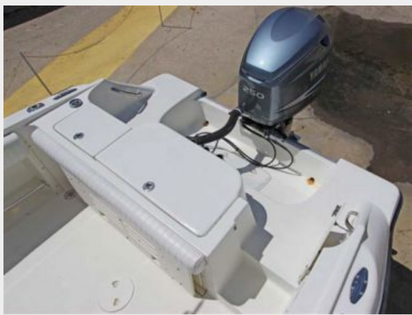
Integrated Transom Swim Platform