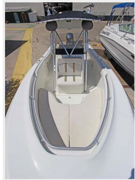
Bow Looking Back