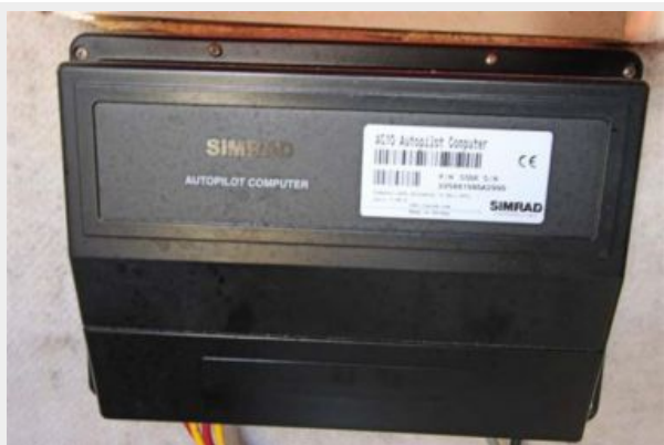
Simrad Autopilot Computer