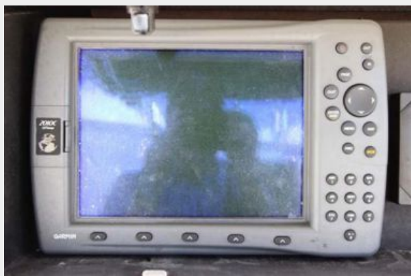
Garmin 2010C Plotter/Sounder