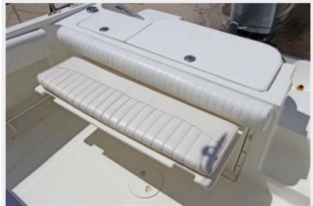
Transom Drop-Down Bench Seat