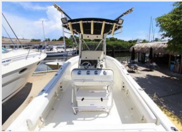
Stern Looking Forward