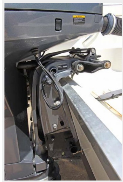
Corrosion Free Clamp Bracket/Motor Mounts