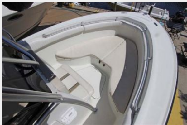
Bow Seating W/Cushions