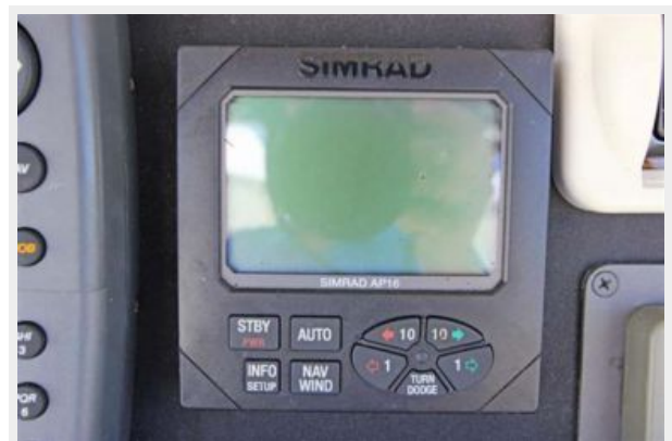
Simrad AP16 Autopilot