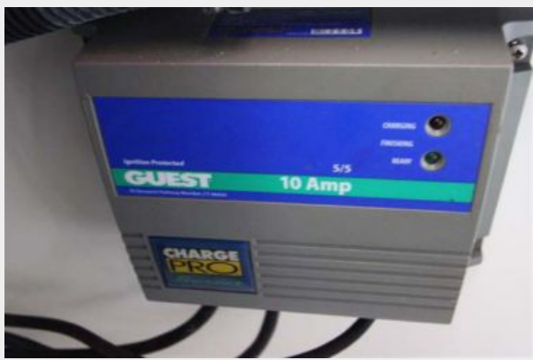
Guest 10 Amp Charger