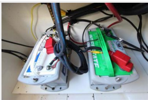
Dual Batteries Mounted In Center Console