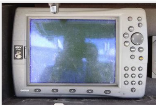
Garmin 2010C Plotter/Sounder