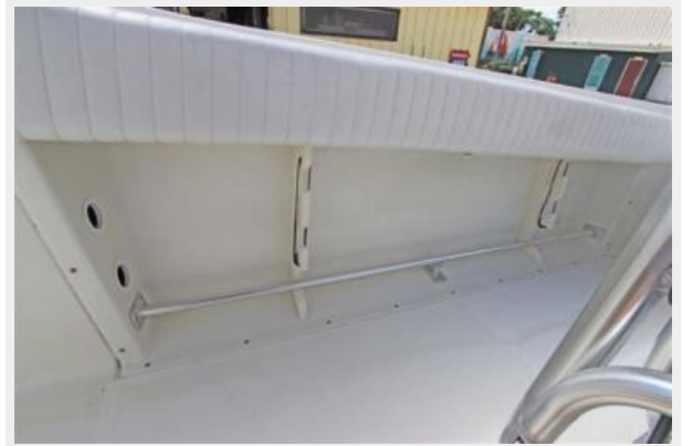
Port & Starboard Gunwale Rod Storage