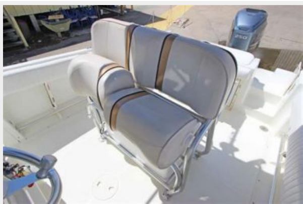
Helm Seating W/Flip-Up Bolsters