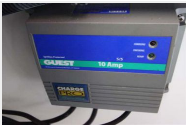
Guest 10 Amp Charger