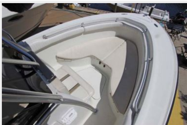
Bow Seating W/Cushions