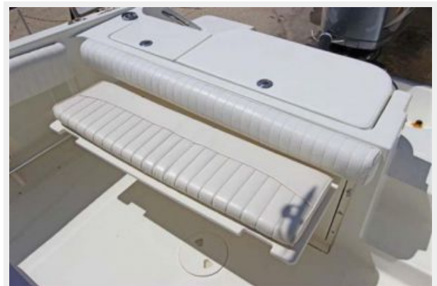
Transom Drop-Down Bench Seat