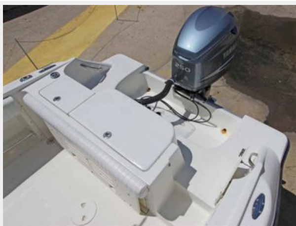
Integrated Transom Swim Platform