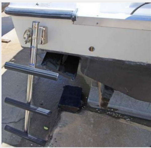
Removable Swim Ladder