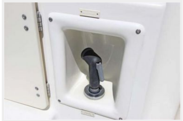
Transom Freshwater Washdown