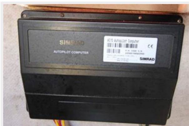
Simrad Autopilot Computer