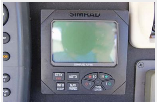
Simrad AP16 Autopilot