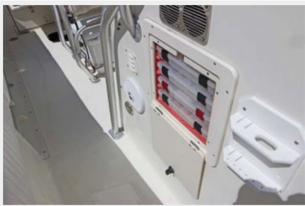
Center Console Tackle Storage