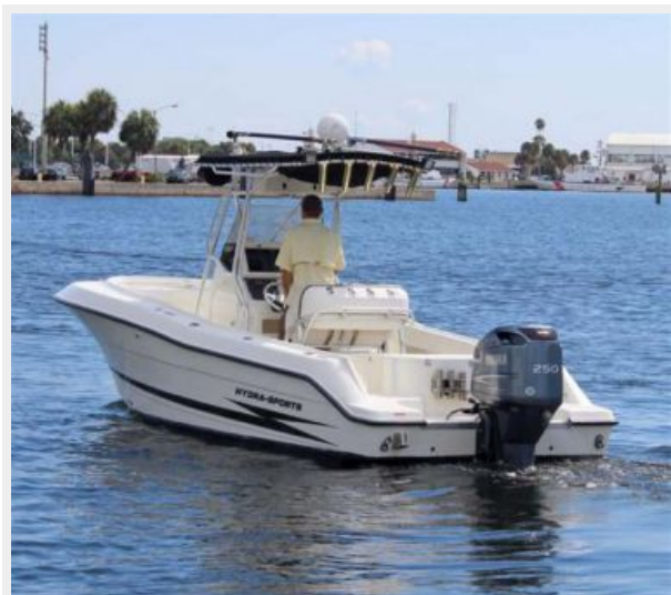
Stern View In Water