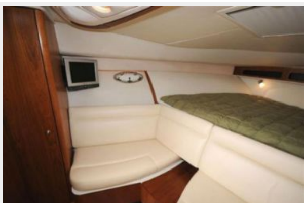
Salon Seating and TV