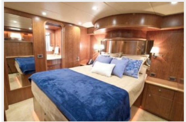
Master Ensuite Head