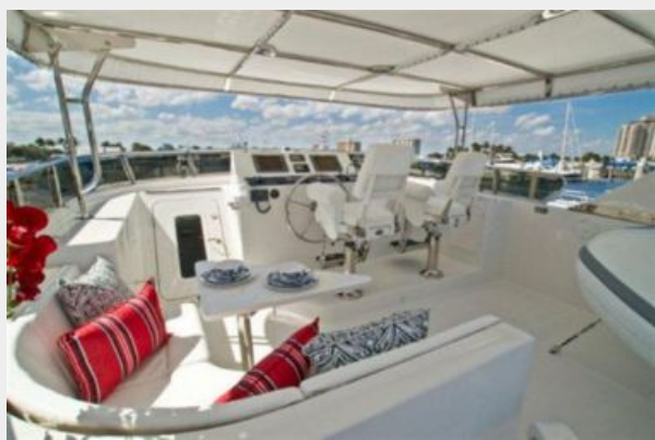
Fly Bridge Seating