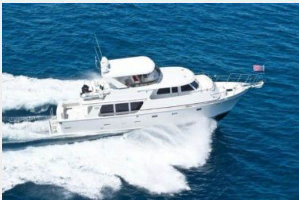
Running Shot 2