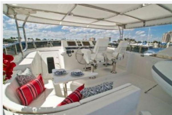
Fly Bridge Seating