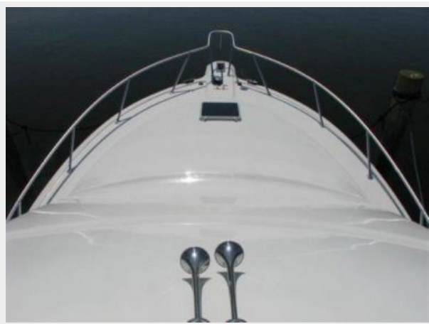
Deck 1 - Bow