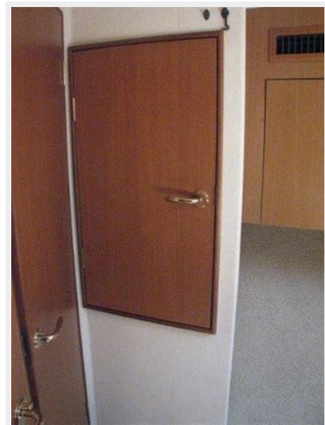
Guest Stateroom 4 - Hanging Locker