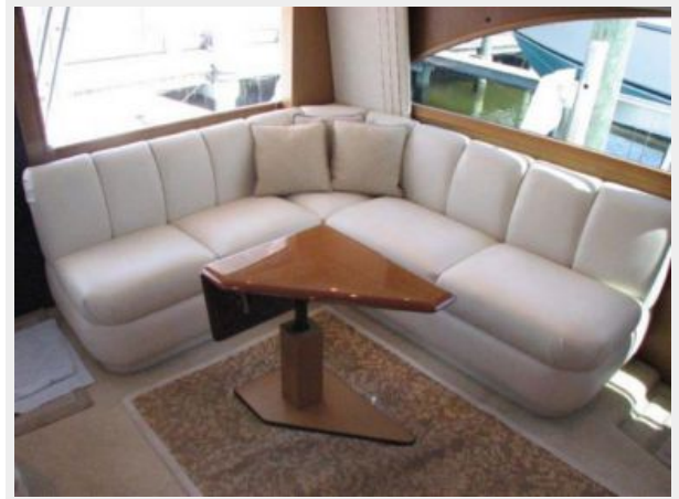
Salon 2 - Sofa