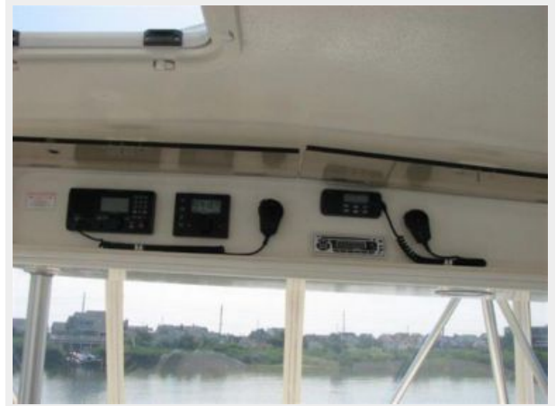
Helm / Electronics & Navigation 3