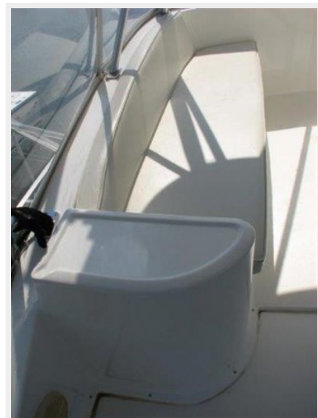
Deck 2 - Bridge Seating