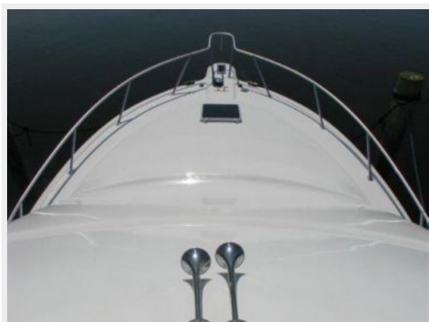
Deck 1 - Bow