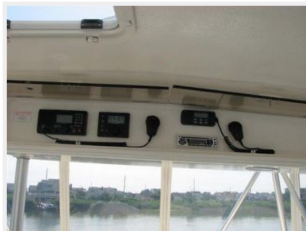
Helm / Electronics & Navigation 3