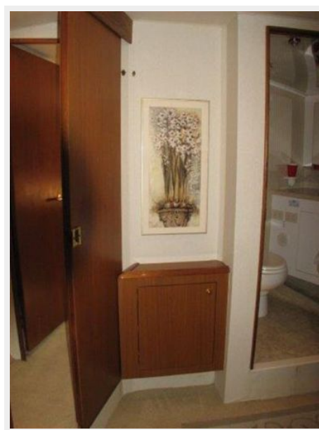
Master Stateroom 3