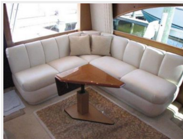
Salon 2 - Sofa