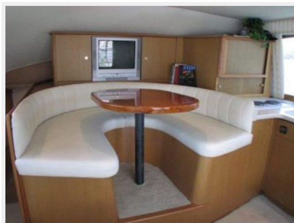
Salon 4 - Dinette