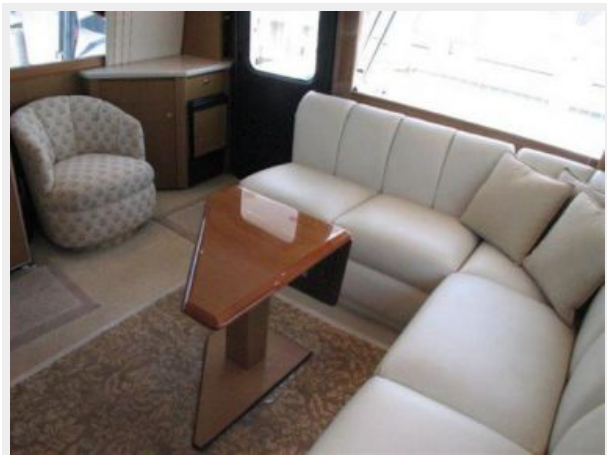
Salon 1 - Sofa, Chair & Hi - Low Table