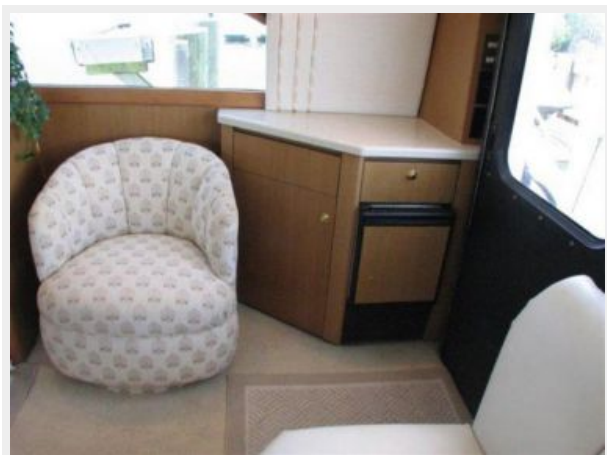
Salon 5 - Chair