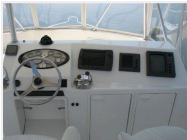
Helm / Electronics & Navigation 2