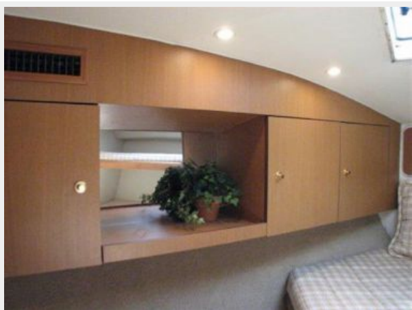
Guest Stateroom 3 - Storage