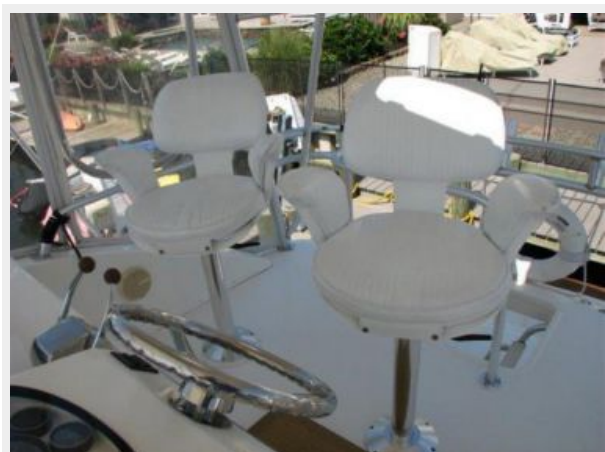
Deck 3 - Helm Seats