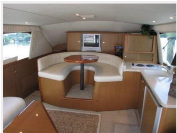
Salon 3 - Dinette