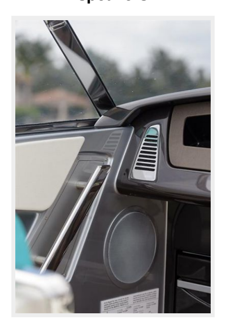
Cockpit seating area