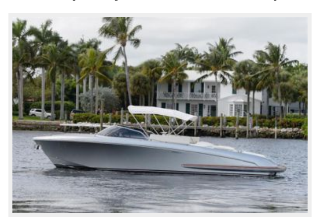
Cockpit seating area covered by bimini top