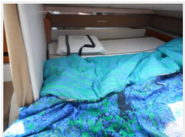
26' Glacier Bay stateroom photo2