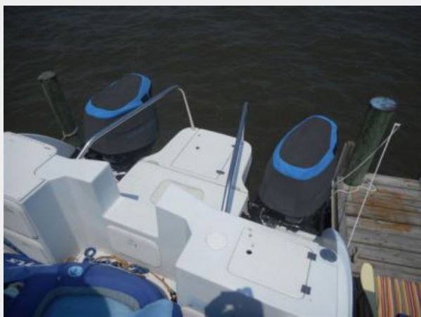
26' Glacier Bay swimplatform