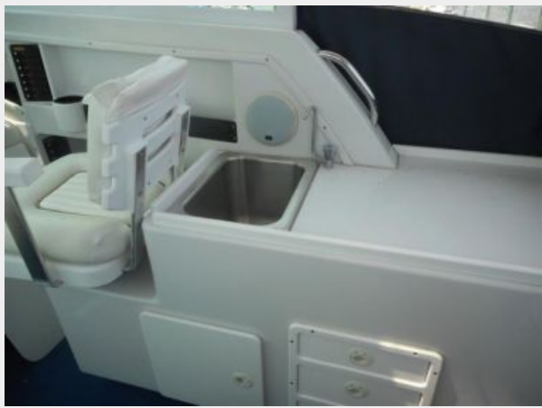
26' Glacier Bay upper deck starboard