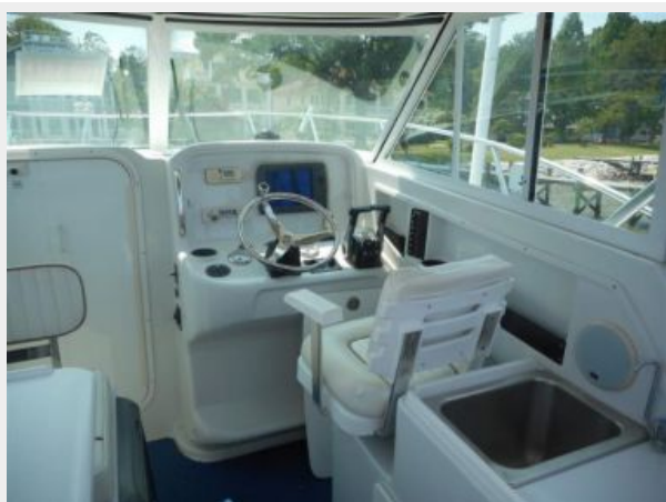
26' Glacier Bay upper deck forward