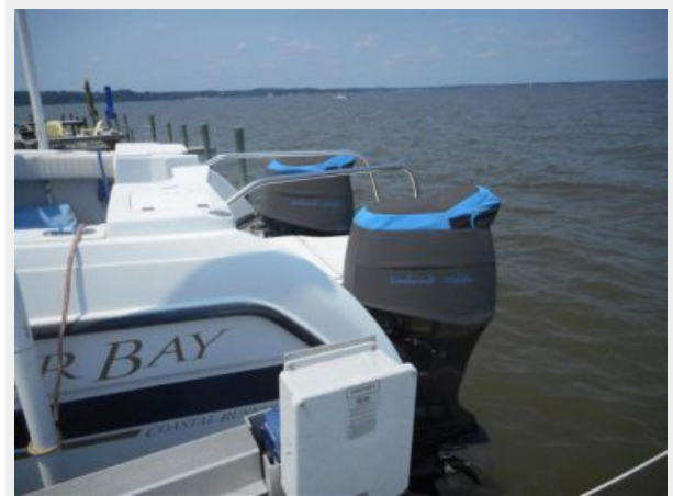
26' Glacier Bay outboards