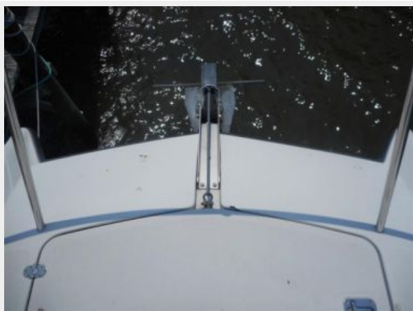
26' Glacier Bay foredeck