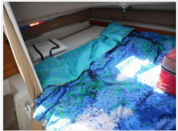
26' Glacier Bay stateroom photo1