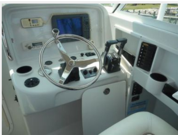
26' Glacier Bay helm