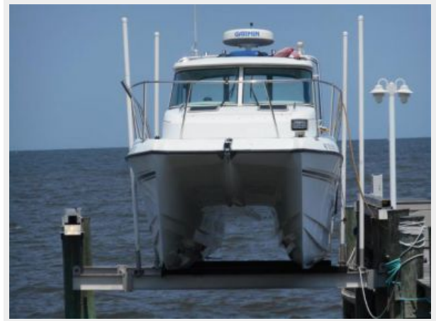
26' Glacier Bay forward profile