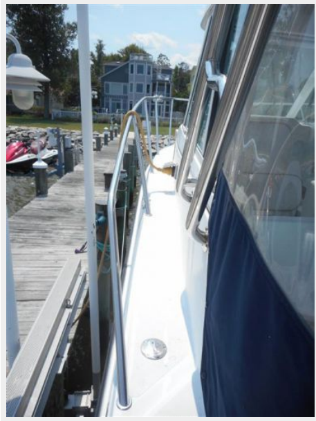
26' Glacier Bay port side deck