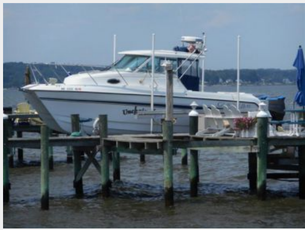
26' Glacier Bay port profile