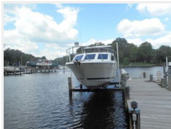
28' Bayliner forward profile