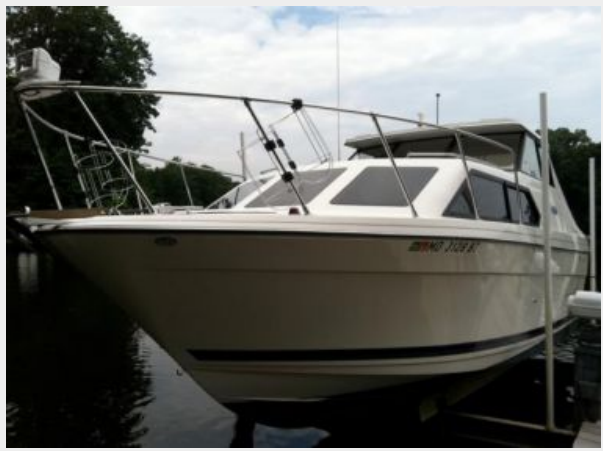
28' Bayliner port forward profile