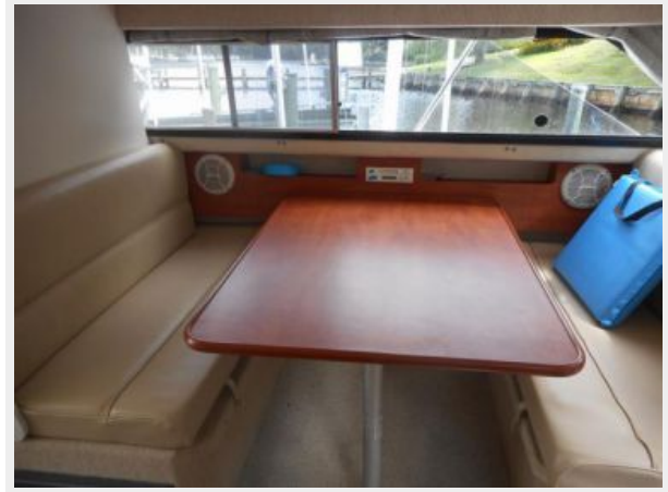
28' Bayliner dinette