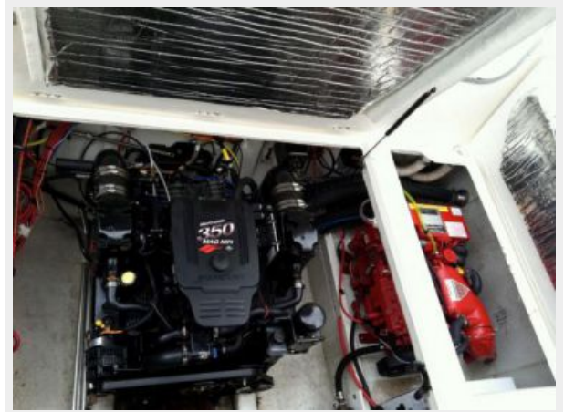
28' Bayliner engine room