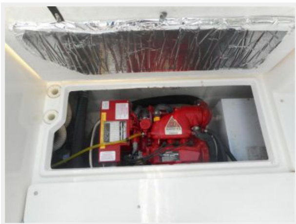
28' Bayliner generator access