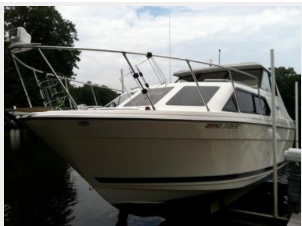
28' Bayliner port forward profile