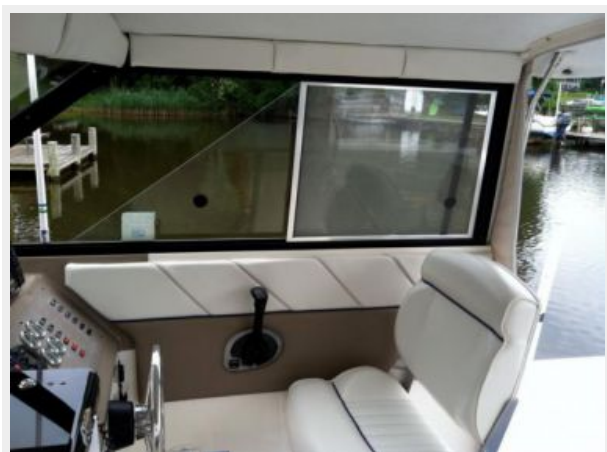
28' Bayliner helm photo2