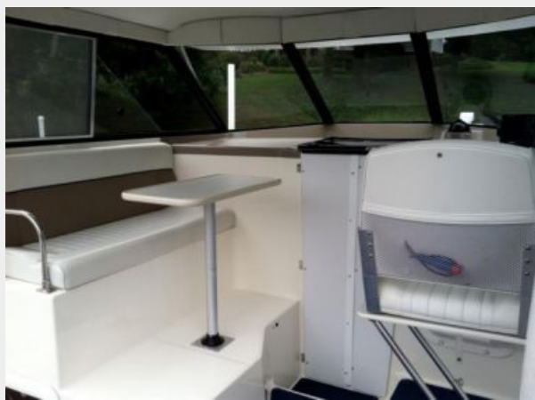
28' Bayliner upper deck forward seating