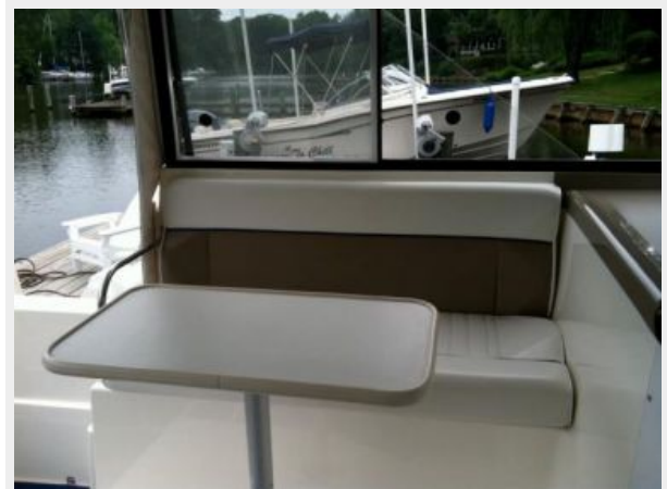
28' Bayliner upper deck aft seating