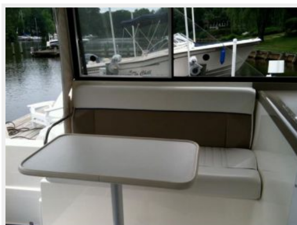
28' Bayliner upper deck aft seating