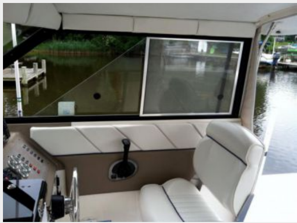
28' Bayliner helm photo2