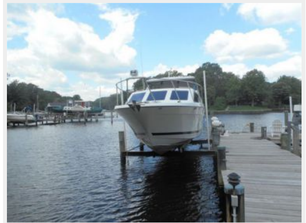
28' Bayliner forward profile