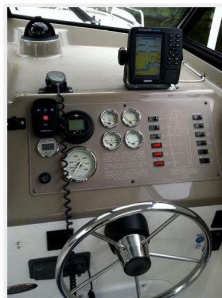
28' Bayliner helm photo3