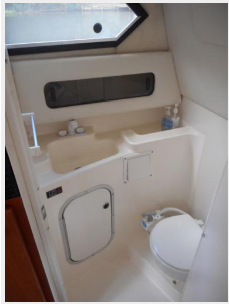
28' Bayliner head