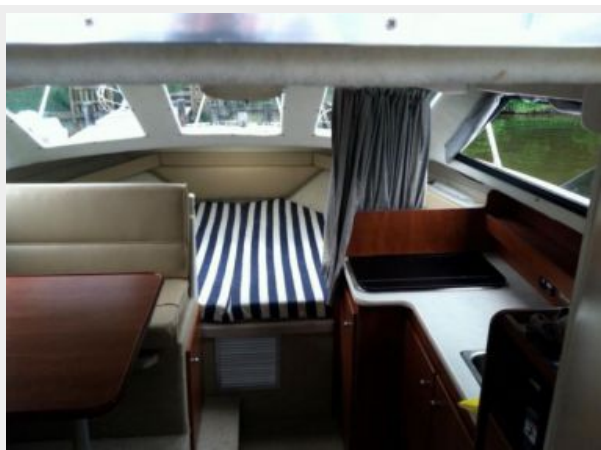
28' Bayliner salon forward