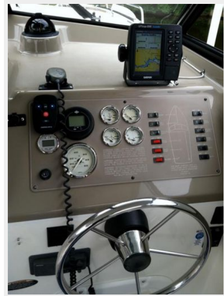
28' Bayliner helm photo3