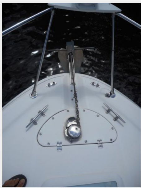
28' Bayliner anchor windlass