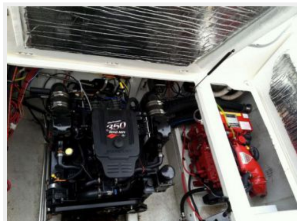
28' Bayliner engine room