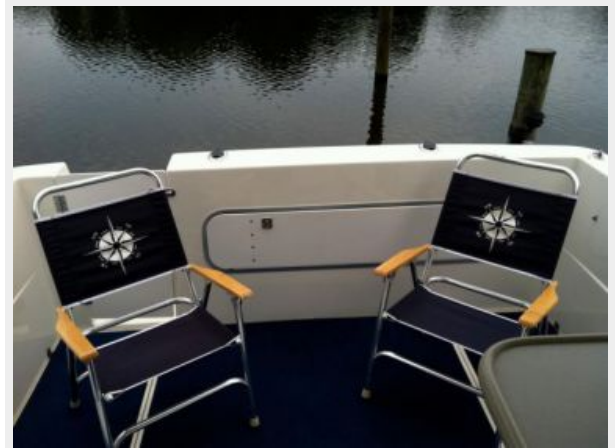
28' Bayliner aftdeck photo2