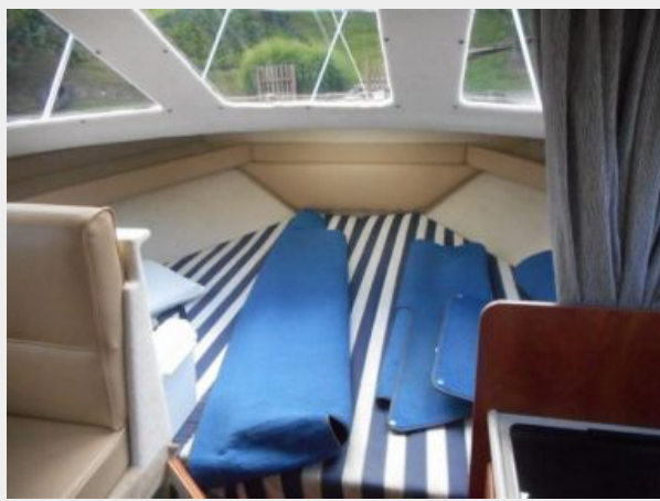
28' Bayliner master stateroom