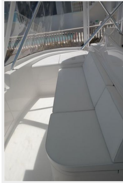
Flybridge Forward Seating