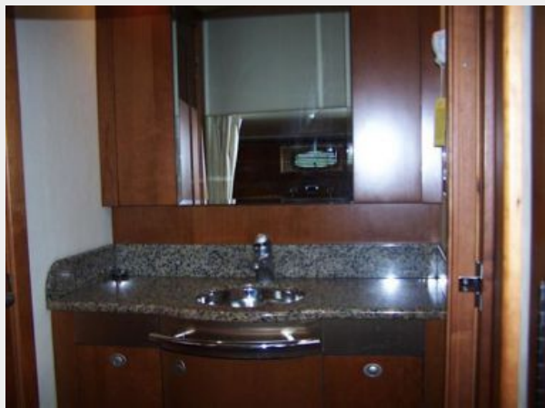
Aft Mid Stateroom Vanity