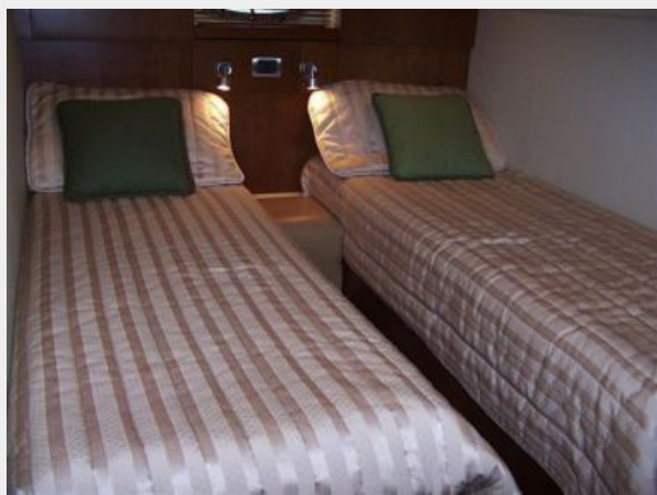
Aft Mid Stateroom