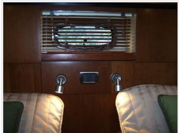
Aft Mid Stateroom Port Lights