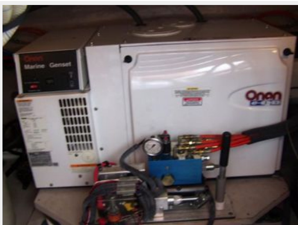
Generator w/ Sound Shield