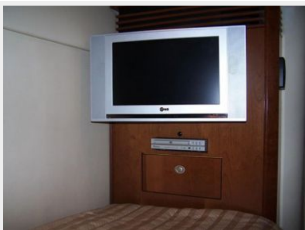
Aft Mid Stateroom TV