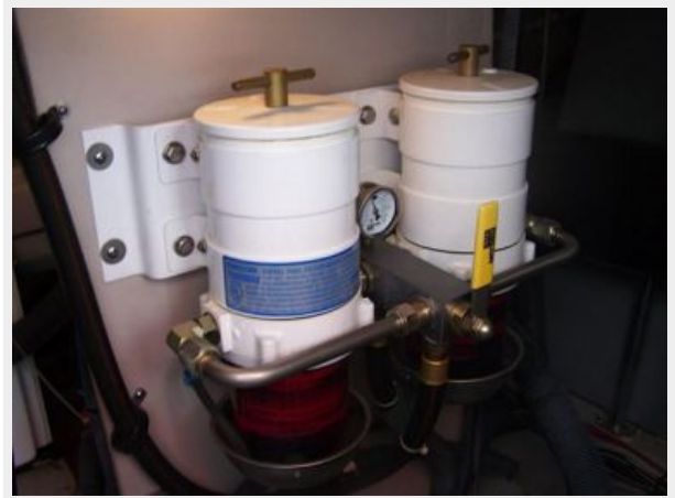
Raycor Fuel Filters