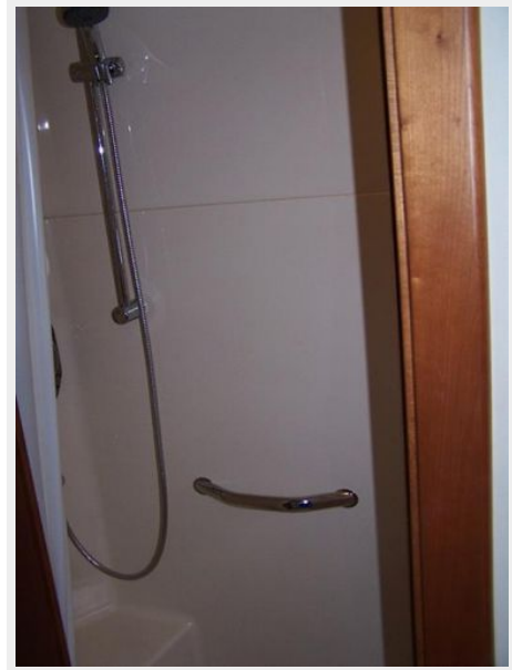
Master Shower Stall