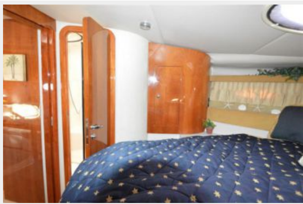
'03 Regal 3860; Master Stateroom Storage & Entrance into Head/ Shower