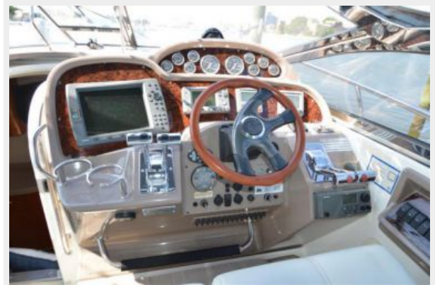
'03 Regal 3860; Helm & Dash