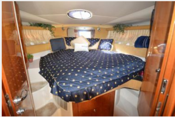
'03 Regal 3860; Master Stateroom