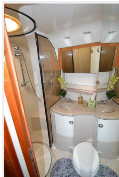
'03 Regal 3860; Enclosed head w/ large Shower