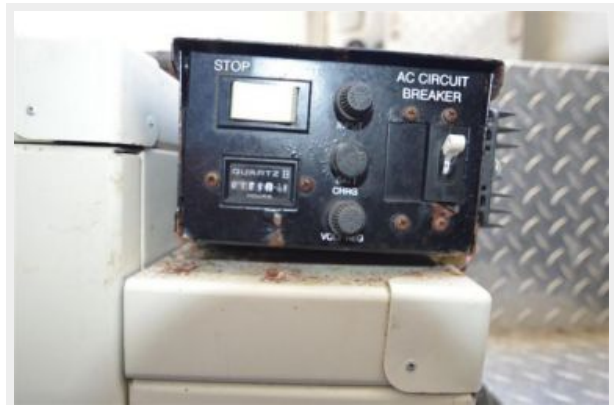
'03 Regal 3860; Generator Hours