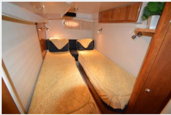
'03 Regal 3860; Guest Stateroom