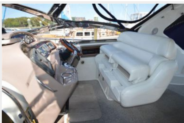
'03 Regal 3860; Double Wide Helm Seat