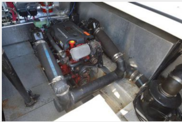
'03 Regal 3860; Stbd Engine