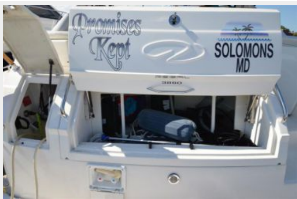
'03 Regal 3860; Lazareet Storage Compartments