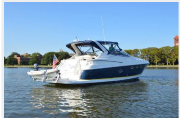
'03 Regal 3860; stbd stern