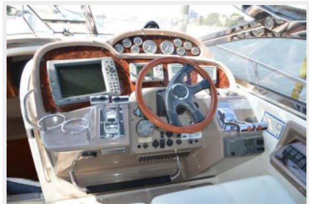
'03 Regal 3860; Helm & Dash