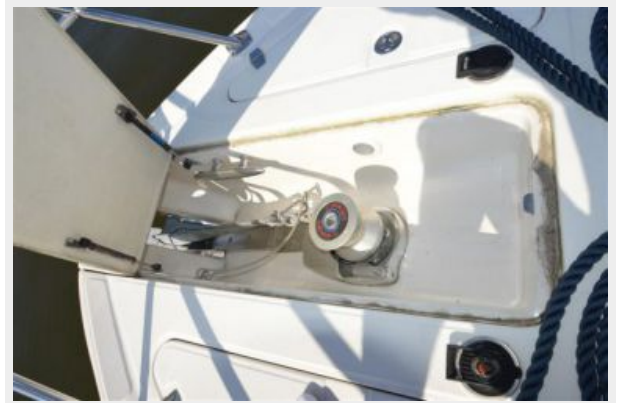
'03 Regal 3860; Anchor Windlass