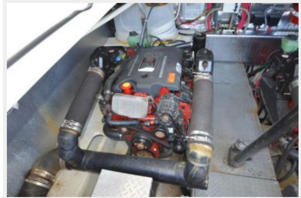
'03 Regal 3860; Port Engine