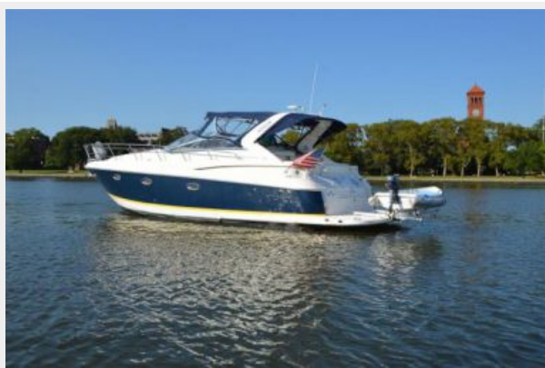
'03 Regal 3860; port beam