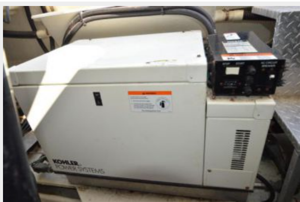
'03 Regal 3860; Kohler Gas Generator Located within Sound Shield