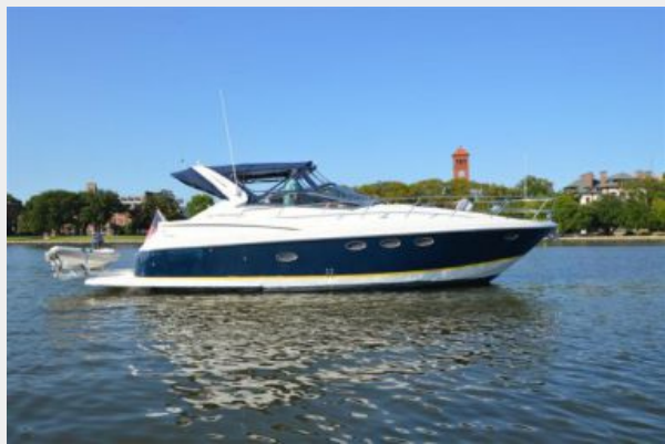
'03 Regal 3860; stbd bow