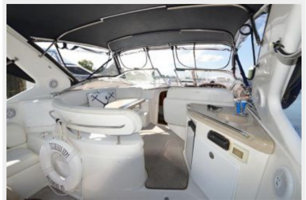
'03 Regal 3860; looking Forward at the Helm Deck