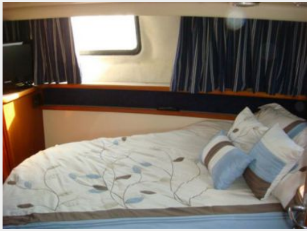
38' Carver master stateroom