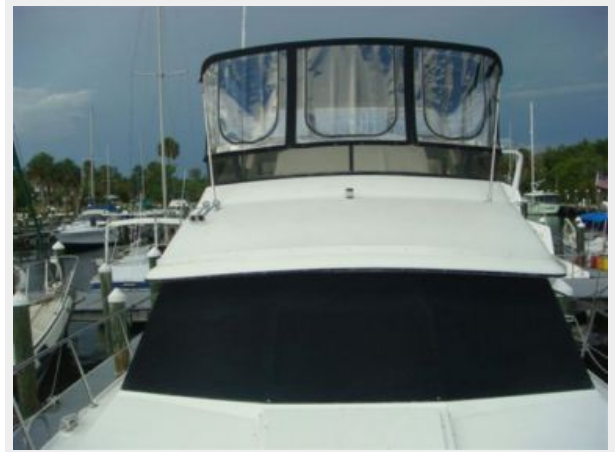
38' Carver foredeck aft