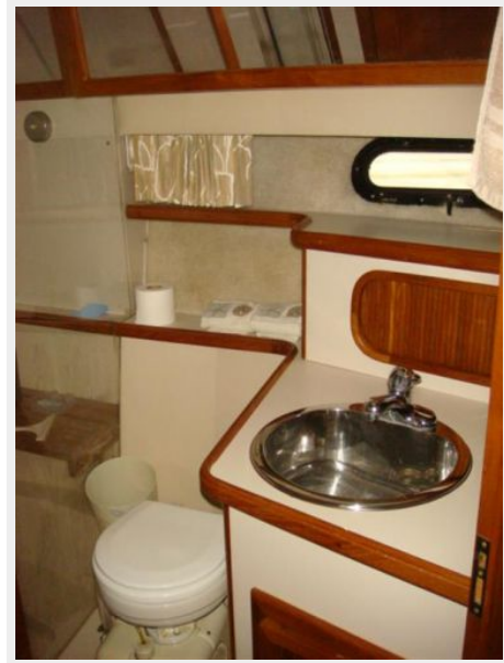
38' Carver guest stateroom head