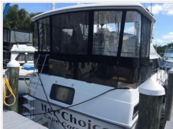
38' Carver aft profile