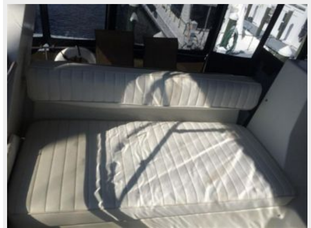
38' Carver flybridge aft seating