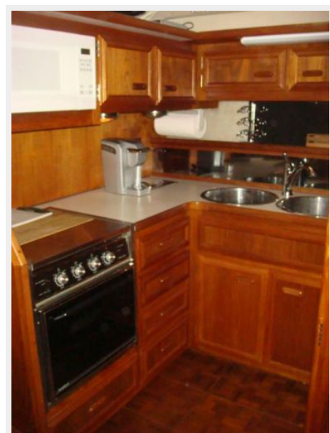
38' Carver galley