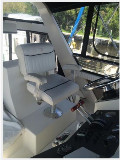
38' Carver flybridge helmseat