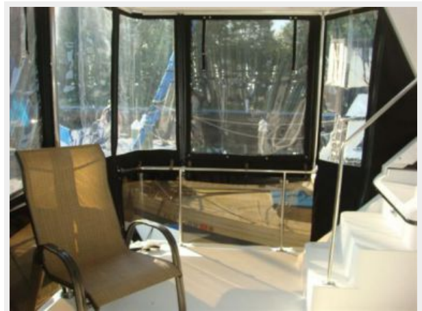
38' Carver sundeck port