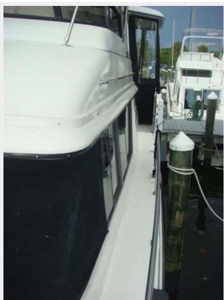
38' Carver port side deck