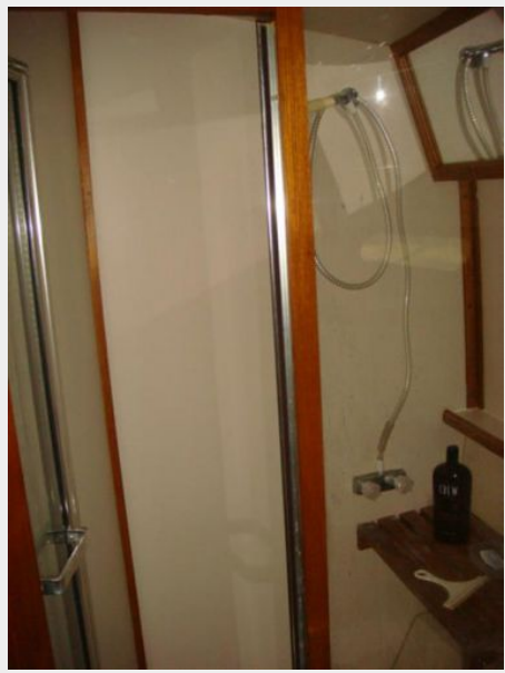
38' Carver master stateroom shower