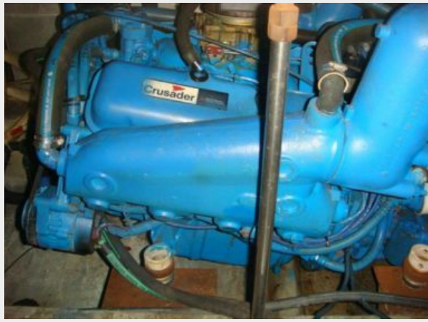
38' Carver starboard main engine