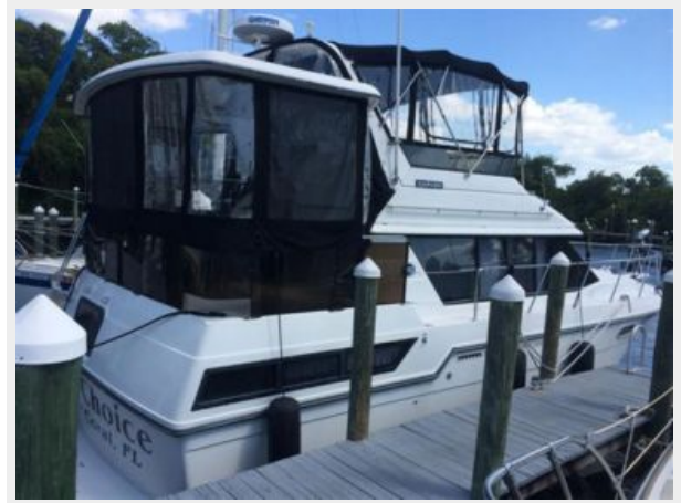
38' Carver starboard aft profile