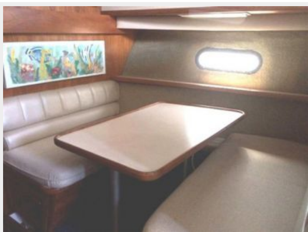
38' Carver dinette