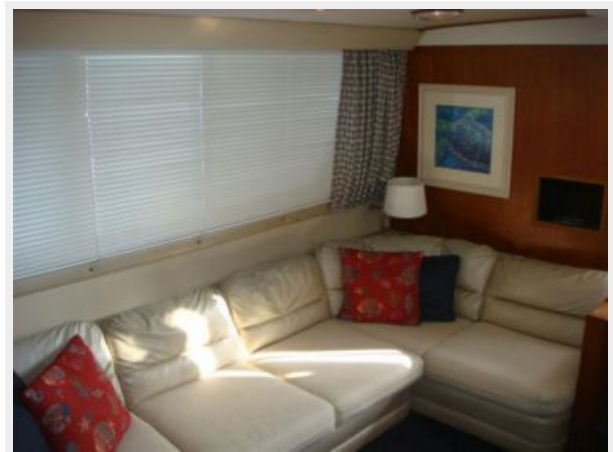
38' Carver salon starboard seating