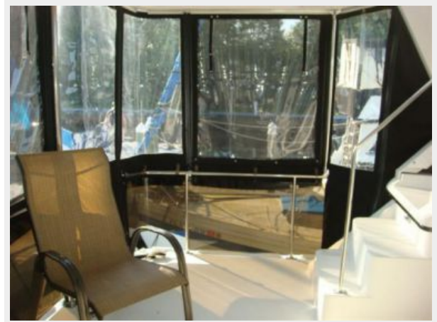
38' Carver sundeck port