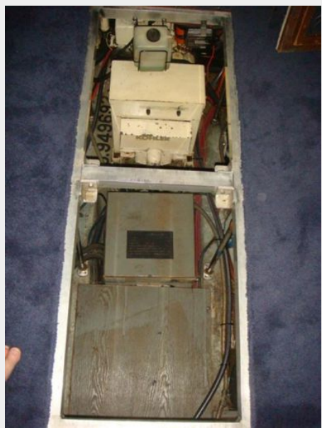
38' Carver engine room access