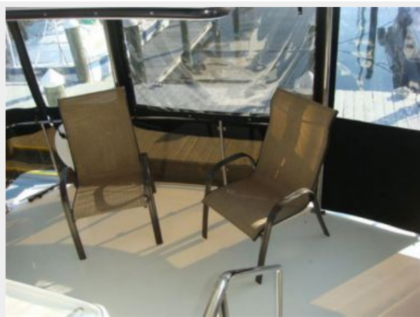
38' Carver sundeck