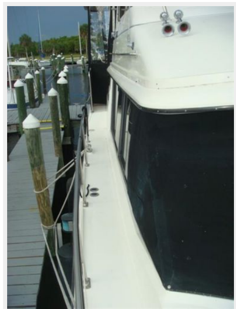
38' Carver starboard side deck