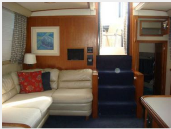
38' Carver salon aft