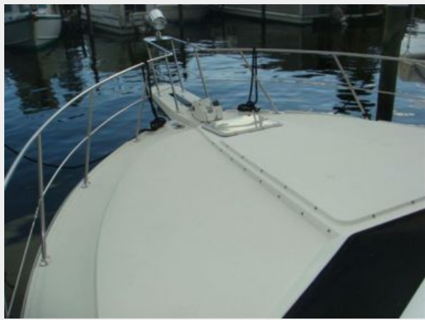
38' Carver foredeck