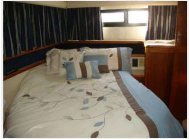
38' Carver master stateroom port