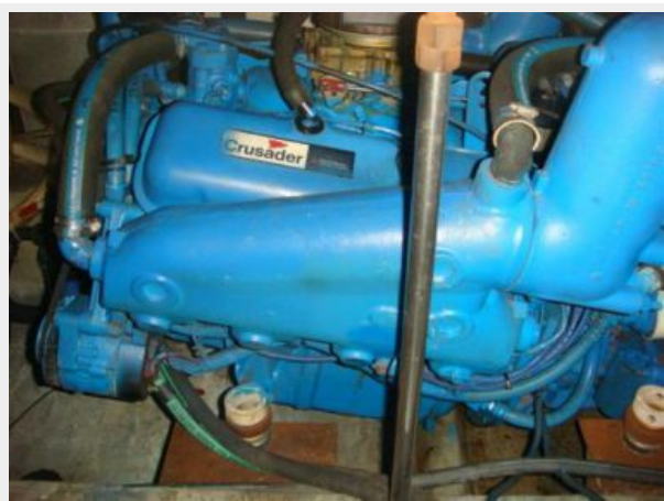
38' Carver starboard main engine