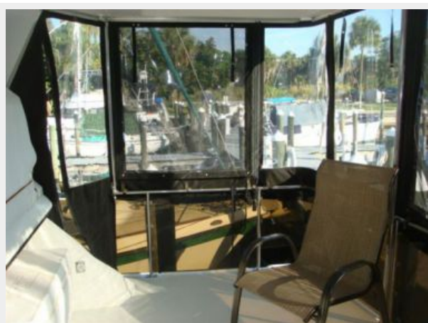
38' Carver sundeck starboard