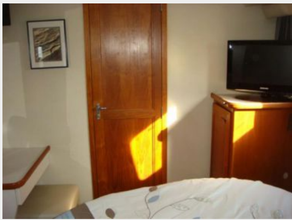
38' Carver master stateroom starboard