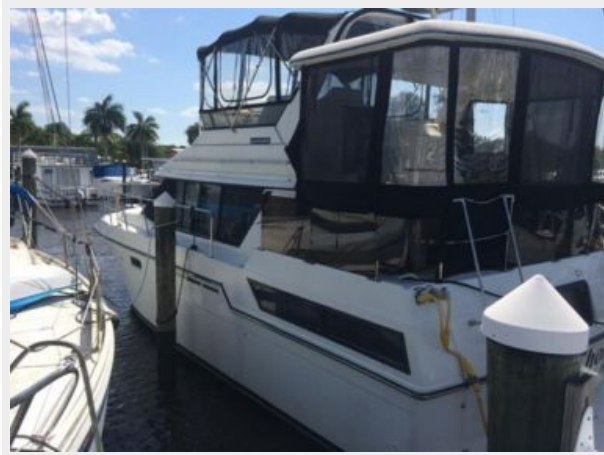
38' Carver port aft profile