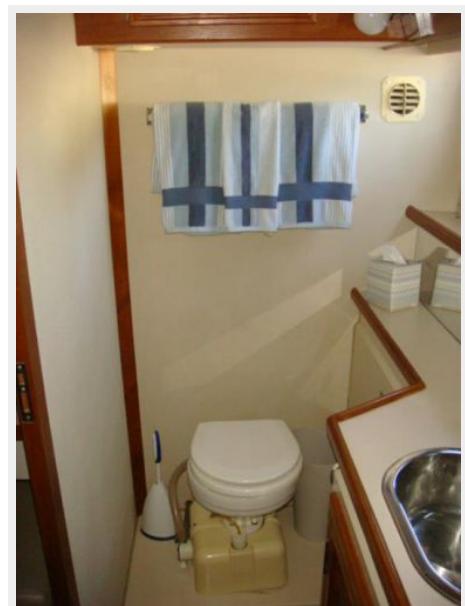
38' Carver master stateroom head