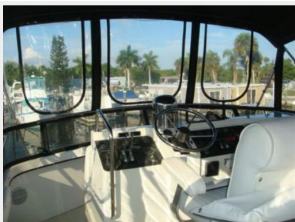
38' Carver flybridge forward