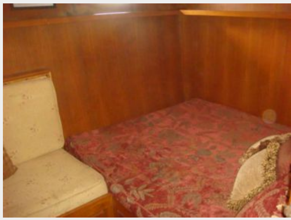
55' Cheoy Lee starboard guest stateroom aft