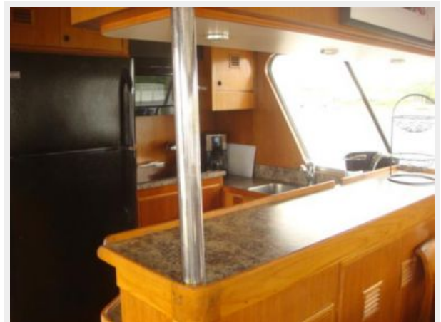
55' Cheoy Lee galley photo1