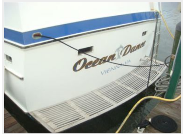
55' Cheoy Lee swimplatform