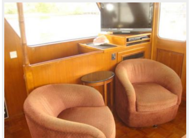
55' Cheoy Lee salon starboard aft