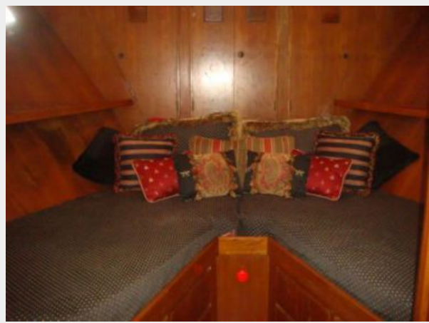
55' Cheoy Lee forward guest stateroom