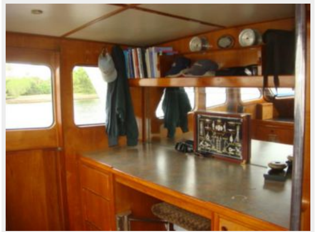
55' Cheoy Lee pilothouse desk