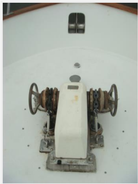
55' Cheoy Lee anchor windlass