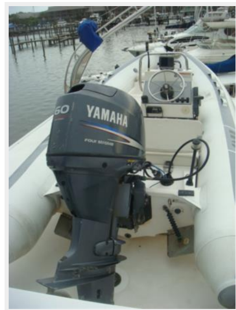
55' Cheoy Lee tender photo2