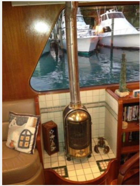
55' Cheoy Lee salon stove