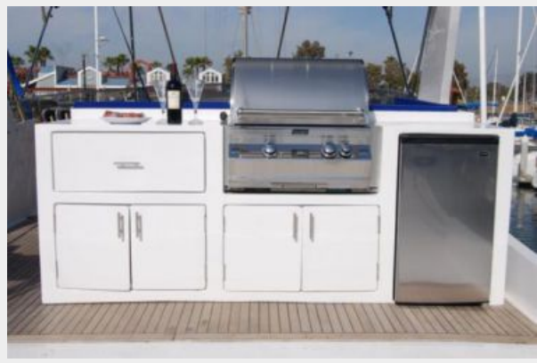
55' Cheoy Lee flybridge grill