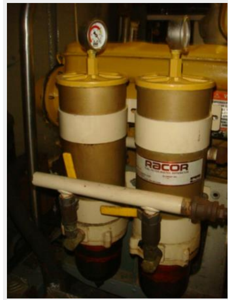
55' Cheoy Lee port Racor fuel filters