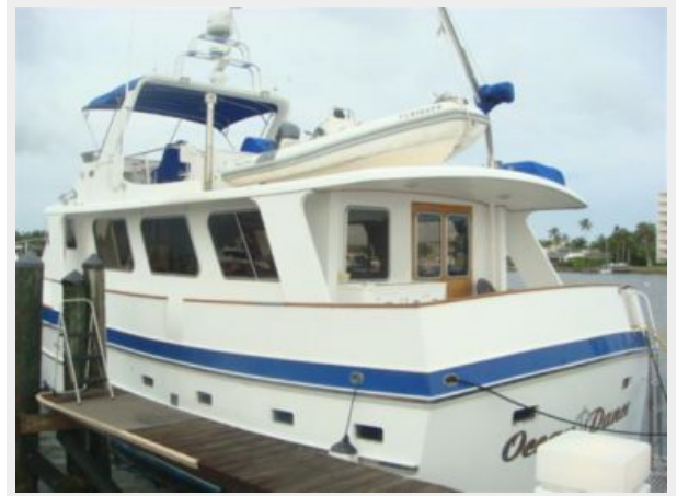
55' Cheoy Lee port aft profile