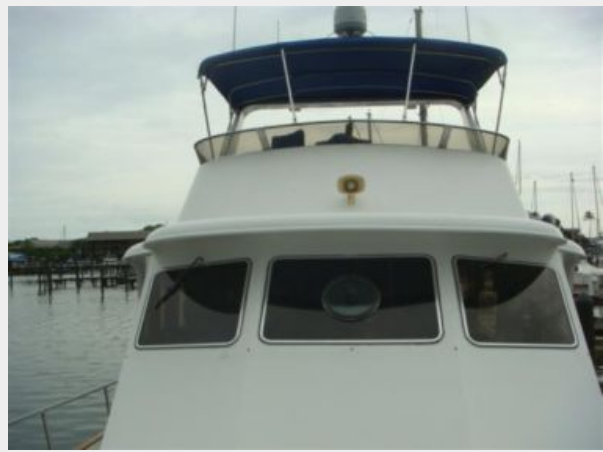
55' Cheoy Lee foredeck aft