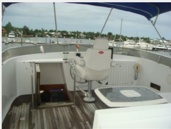
55' Cheoy Lee flybridge forward