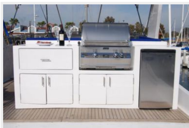
55' Cheoy Lee flybridge grill