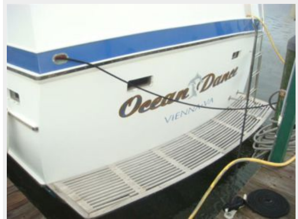
55' Cheoy Lee swimplatform