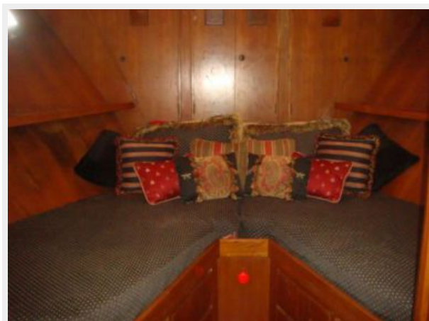
55' Cheoy Lee forward guest stateroom