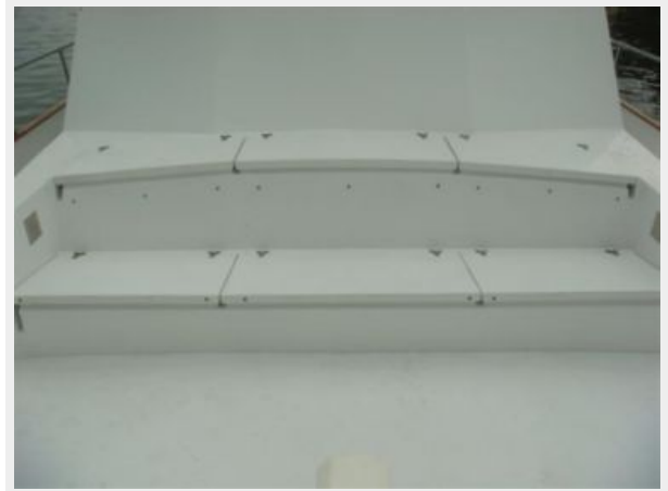
55' Cheoy Lee foredeck seating