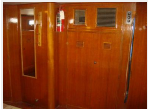
55' cheoy Lee master stateroom forward