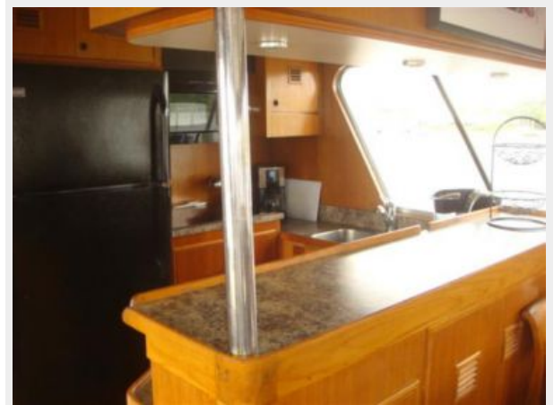
55' Cheoy Lee galley photo1