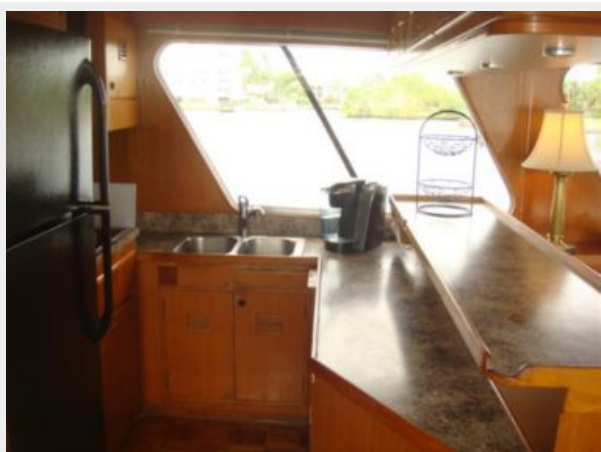
55' Cheoy Lee galley photo2