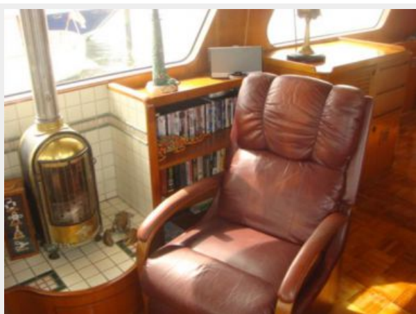
55' Cheoy Lee salon port forward