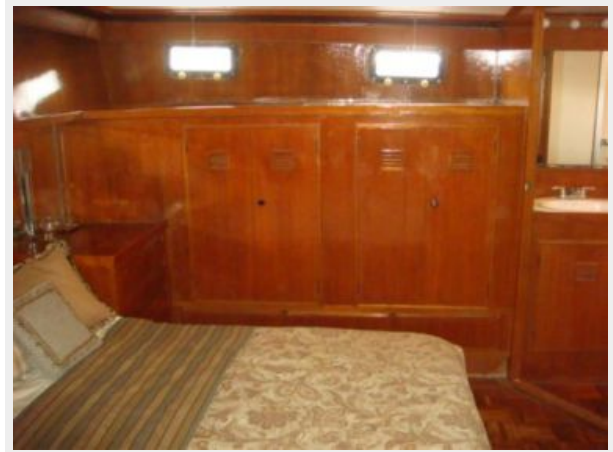
55' Cheoy Lee master stateroom port