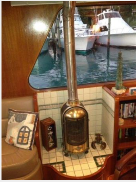
55' Cheoy Lee salon stove