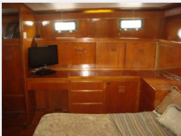
55' Cheoy Lee master stateroom starboard