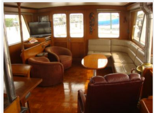
55' Cheoy Lee salon aft