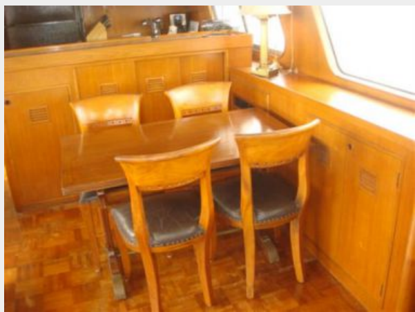
55' Cheoy Lee dining table