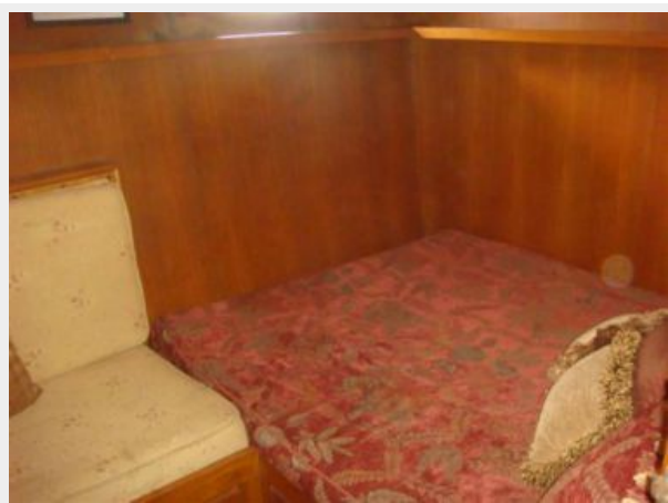
55' Cheoy Lee starboard guest stateroom aft