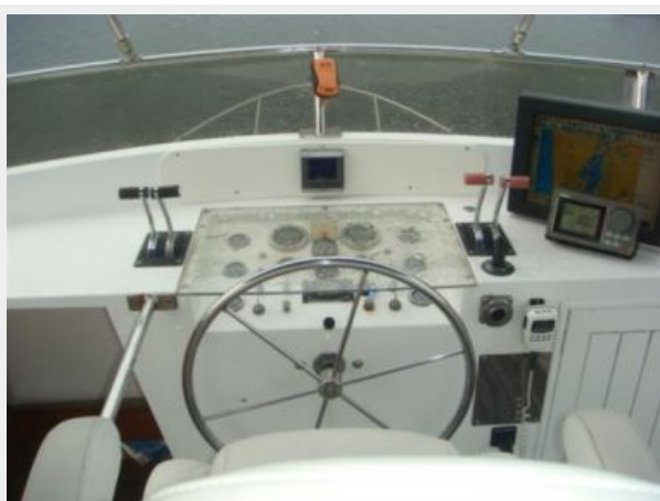
55' Cheoy Lee flybridge helm