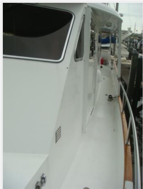
55' Cheoy Lee port side deck photo1