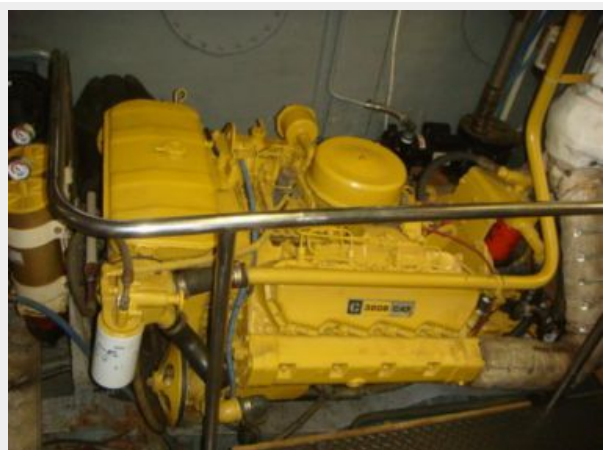
55' Cheoy Lee starboard main engine