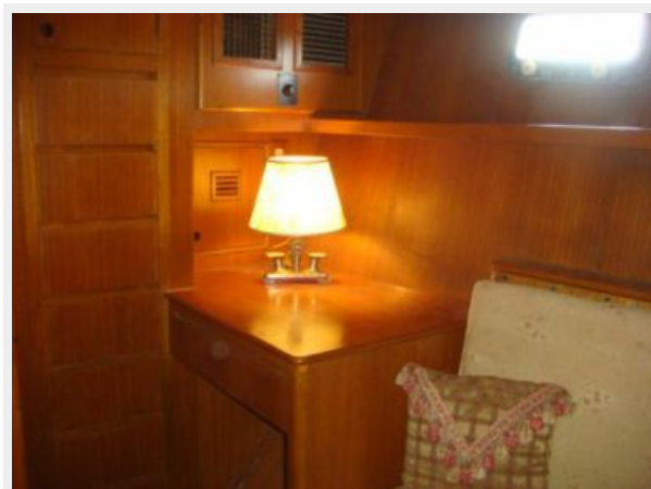
55' Cheoy Lee starboard guest stateroom forward