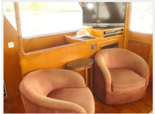
55' Cheoy Lee salon starboard aft