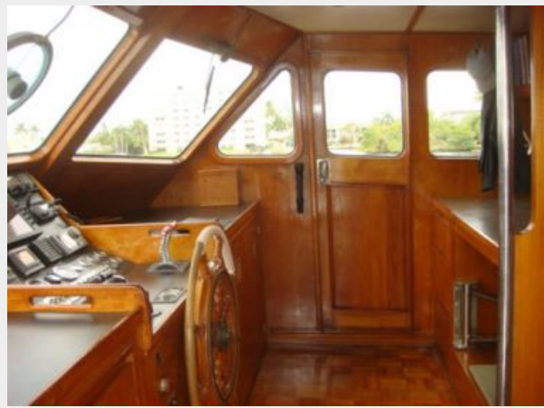
55' Cheoy Lee pilothouse starboard