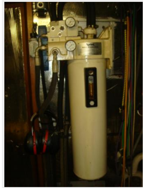
55' Cheoy Lee stabilizer system