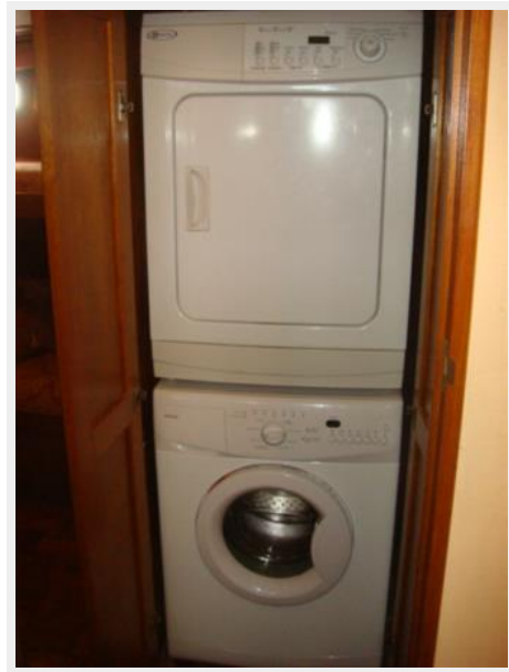
55' Cheoy Lee washer-dryer