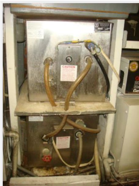
55' Cheoy Lee water heaters