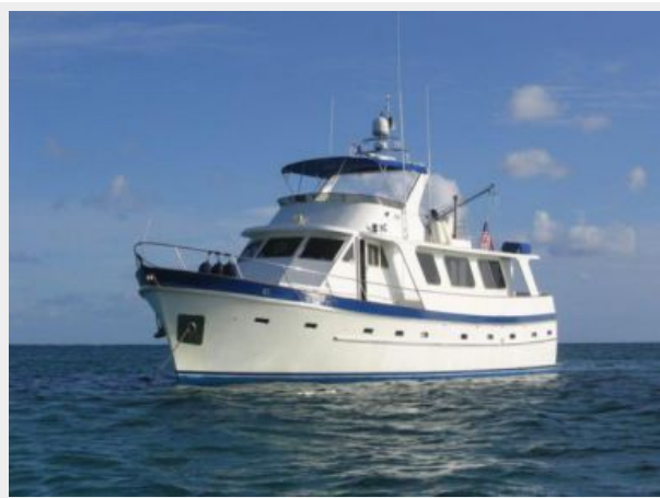
55' Cheoy Lee port forward profile