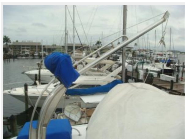
55' Cheoy Lee tender davit