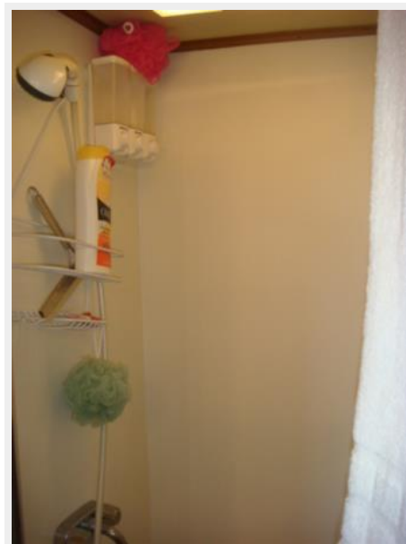
55' Cheoy Lee forward guest stateroom head