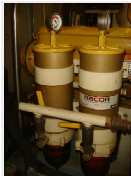
55' Cheoy Lee port Racor fuel filters