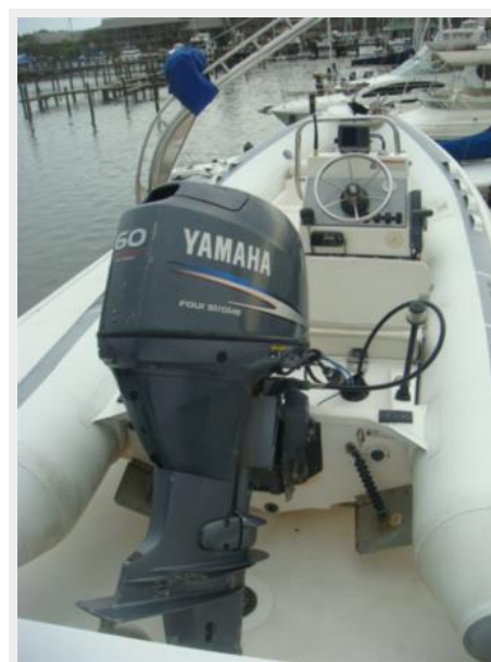
55' Cheoy Lee tender photo2