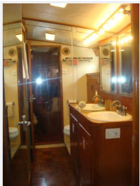
55' Cheoy Lee port guest stateroom head