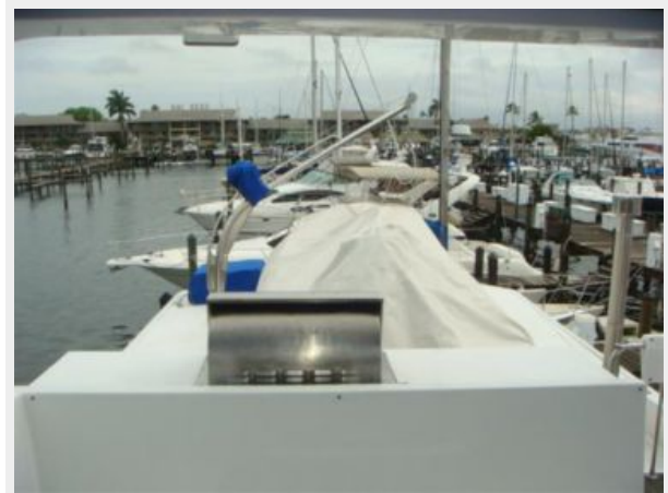
55' Cheoy Lee flybridge aft