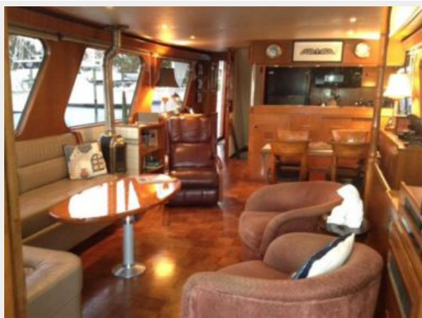
55' Cheoy Lee salon forward