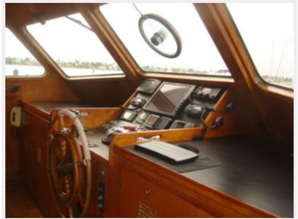
55' Cheoy Lee pilothouse helm photo1