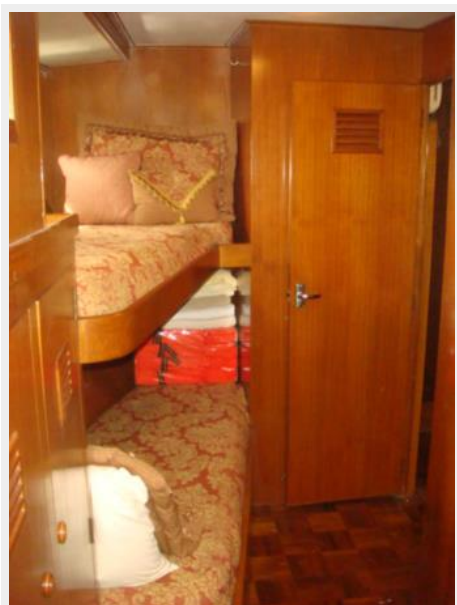
55' Cheoy Lee port guest stateroom forward