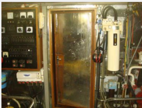
55' Cheoy Lee engine room forward