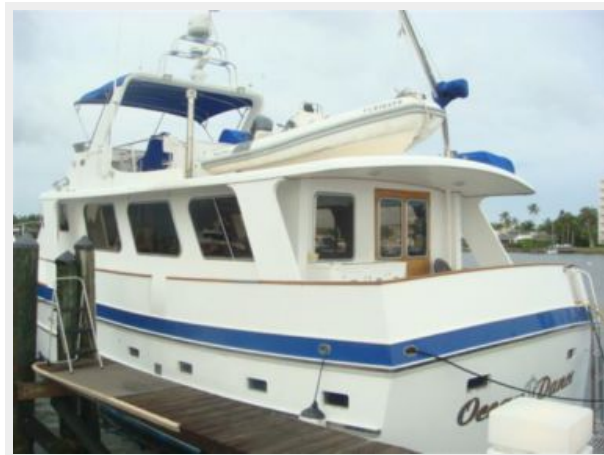
55' Cheoy Lee port aft profile