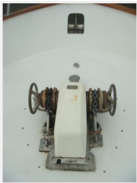
55' Cheoy Lee anchor windlass