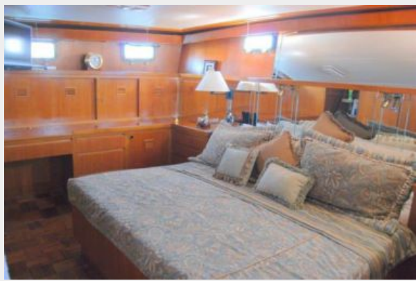
55' Cheoy Lee master stateroom photo2