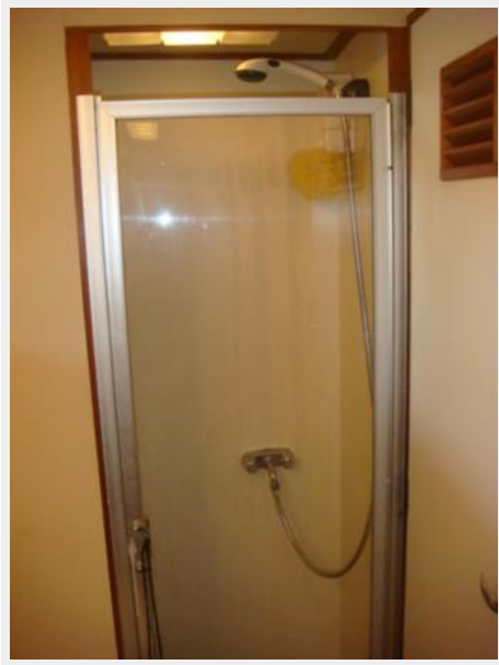
55' Cheoy Lee forward guest stateroom shower