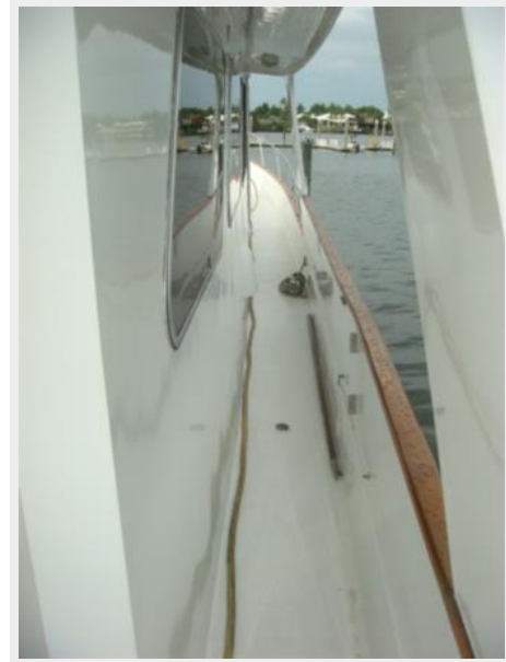
55' Cheoy Lee starboard side deck photo2