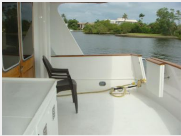
55' Cheoy Lee aftdeck starboard