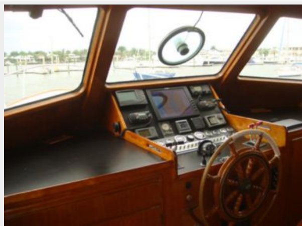
55' Cheoy Lee pilothouse helm photo2