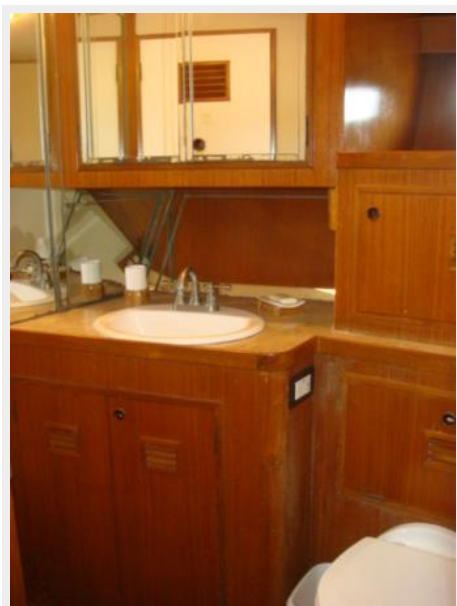
55' Cheoy Lee master stateroom head