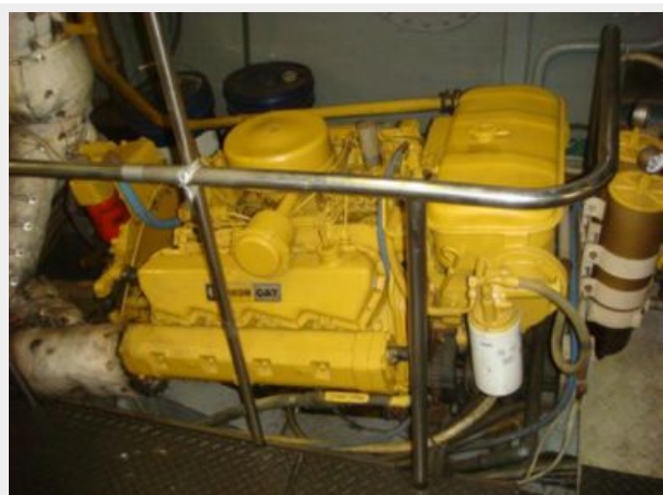
55' Cheoy Lee port main engine