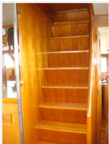
55' Cheoy Lee pilothouse-flybirsge stairs