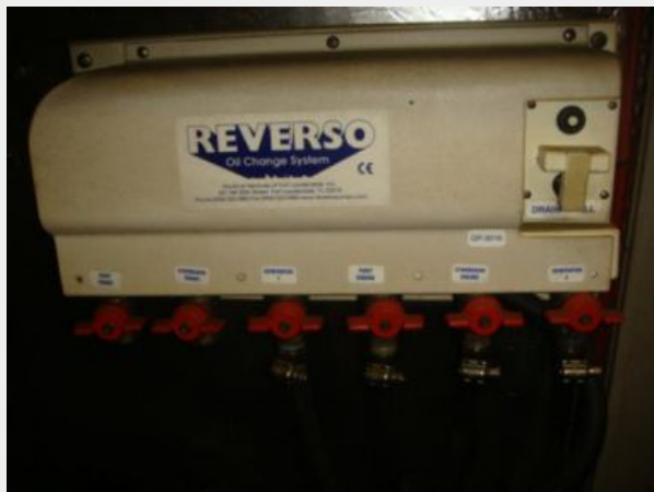
55' Cheoy Lee oil change system