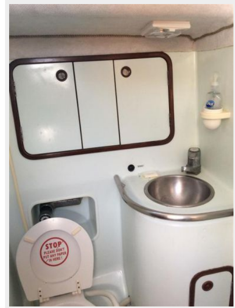
Starboard aft head