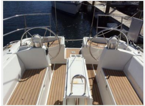
Cockpit looking aft