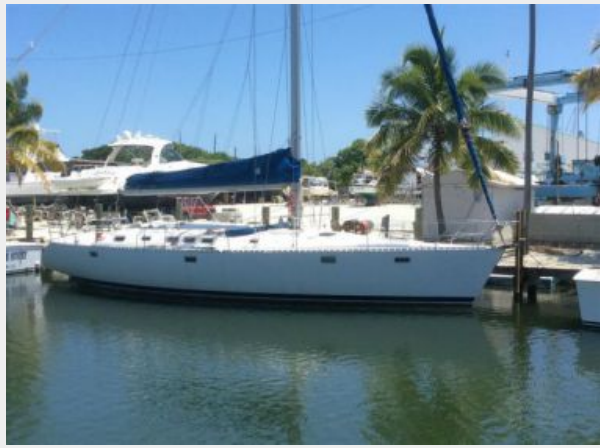
Starboard side view