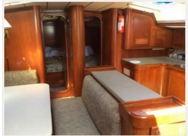
Salon looking forward