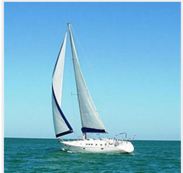
Port side view underway