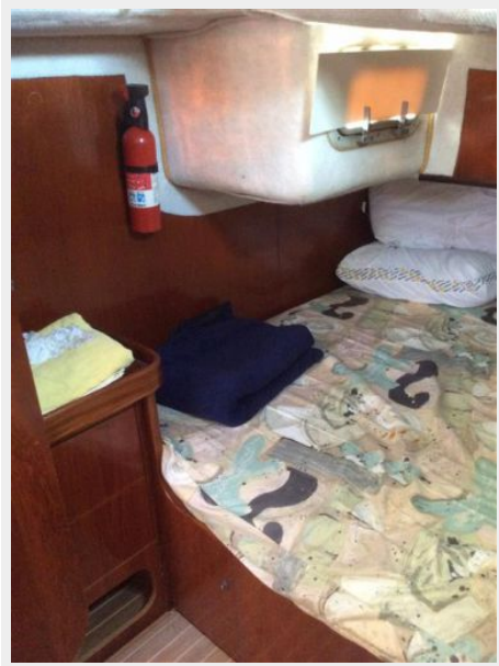
Starboard aft stateroom