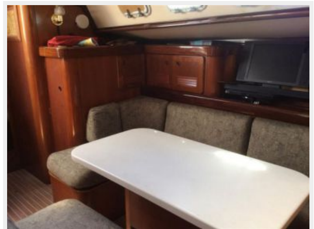
Dinette port side salon