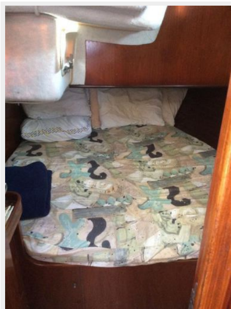
Port aft stateroom