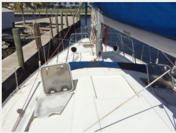
Topside looking forward