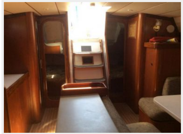
Salon looking aft