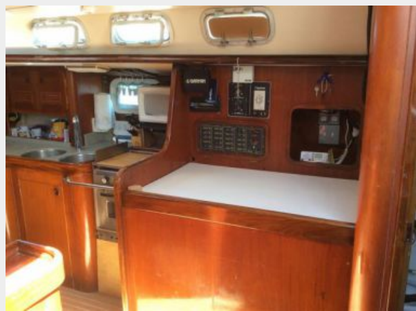
Navigation center starboard side aft of galley