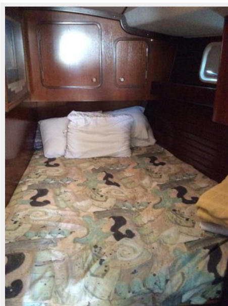
Starboard forward stateroom