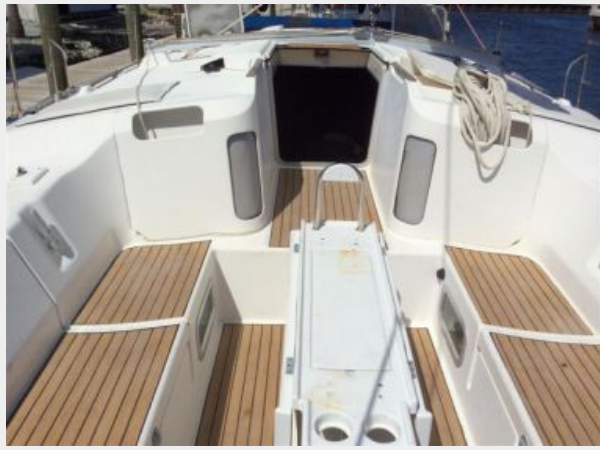
Cockpit looking forward