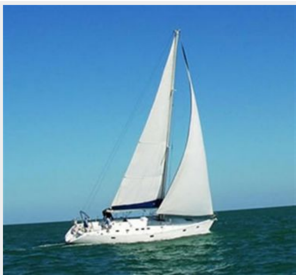
Starboard side view underway