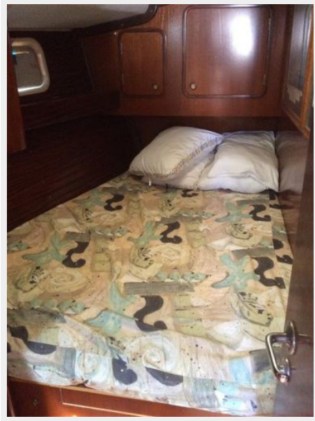
Port forward stateroom