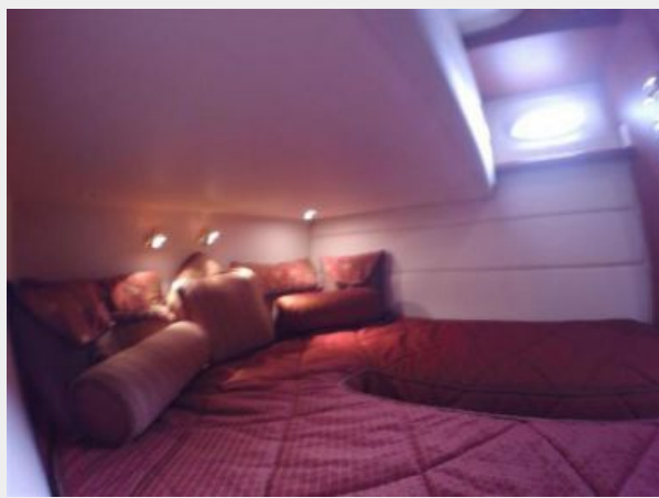
Port Guest Stateroom