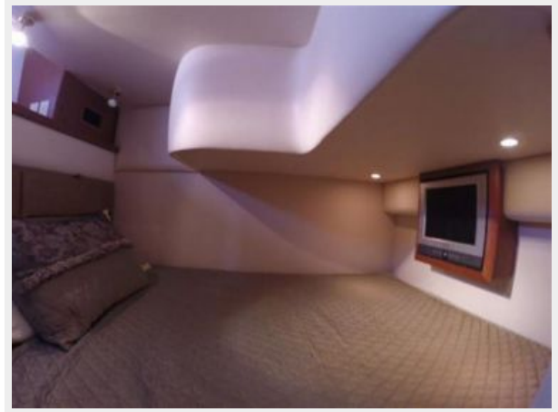
Starboard Guest Stateroom