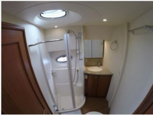
Day Head / Shower - Port Side