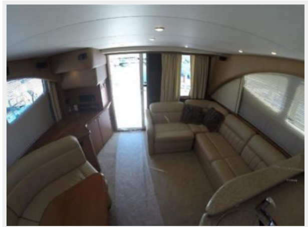
Salon Facing Aft