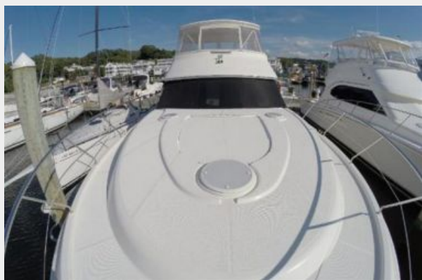
Bow facing aft