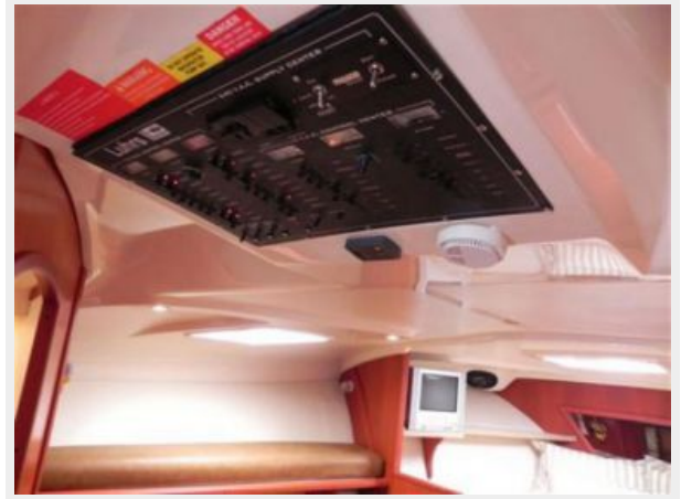
Overhead electrical panel