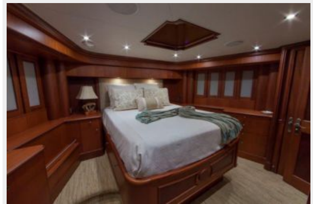
VIP Guest Stateroom