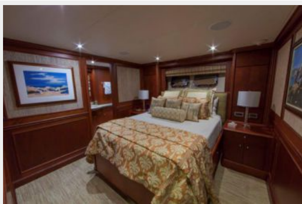
Port Guest Stateroom