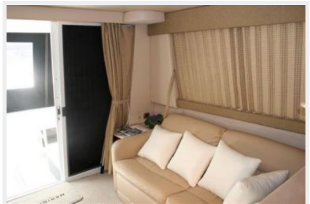
Salon Seating 2