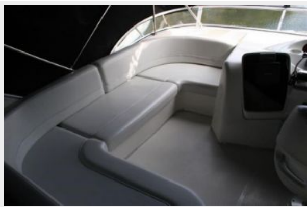
Flybridge seating 2