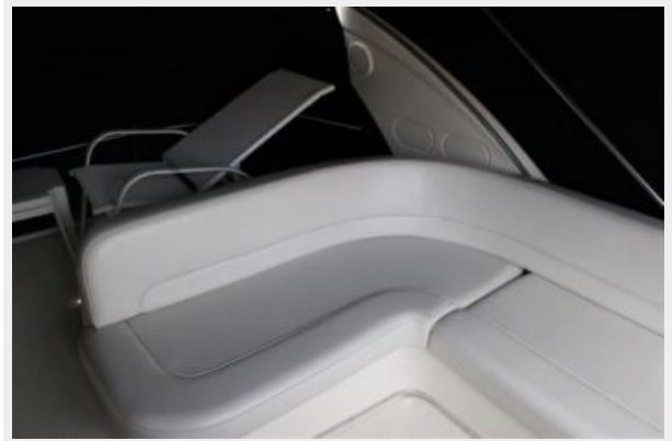
Flybridge seating 1