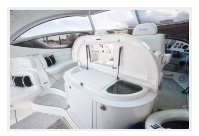
Cockpit - Wetbar