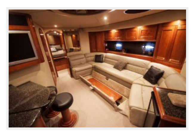
Salon Stow-Away Table